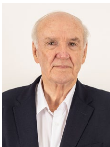
José Antonio García Belaúnde, President

We are committed to continue working in partnership with all stakeholders to ensure that the organisation remains an effective bridge between our regions. Multilateral cooperation, bi-regional dialogue and the promotion of shared values will continue to be pillars of our management, driving initiatives that address the global challenges we face.