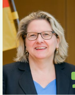
Svenja Schulze German Federal Environment Minister

The lack of sound management of chemicals, which are part and parcel of daily life, is toxifying our planet and all life on it. It is absolutely imperative to strengthen good governance of chemicals and waste - through effective, inspiring, and innovative laws and policies, such as those represented by the winners of the Future Policy Award 2021. They set a precedent, which hopefully many governments will follow.