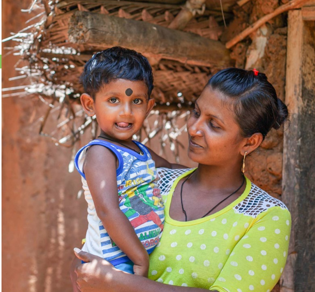
Young woman and her child in the North Central Province of Sri Lanka after surviving her act of pesticide self poisoning due to the relatively low toxicity of many commonly used pesticides.

decreases in suicide rates ever achieved in the world: The country's suicide rate has been reduced by 70 percent , particularly in rural villages and of children and young adults aged 17 to 25 years.