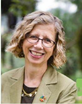
Inger Andersen Executive Director of the United Nations Environment Programme (UNEP)