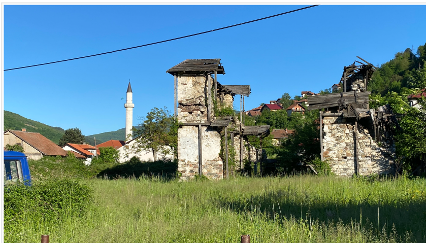
Figure 2. Mosques in the Town of Foča (Eastern Bosnia)