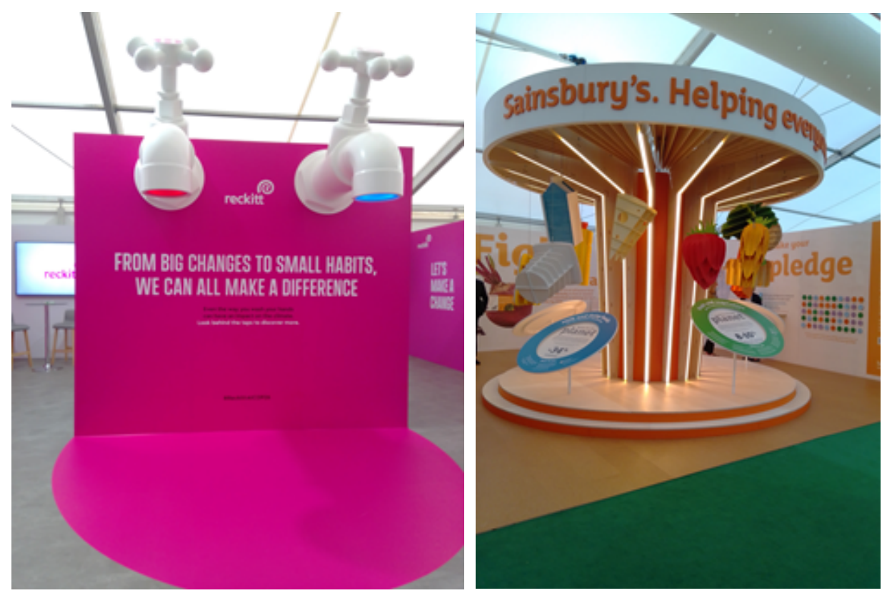
Figure 4: Reckitt and Sainsbury's Showcases of COP26 Sponsor, Green Zone Groundfloor

economies – such as the symbolically charged E-racing car (which attracted a lot of attention in the Blue Zone) that greeted visitors on the ground floor near the registration desk (Croeser 2021).