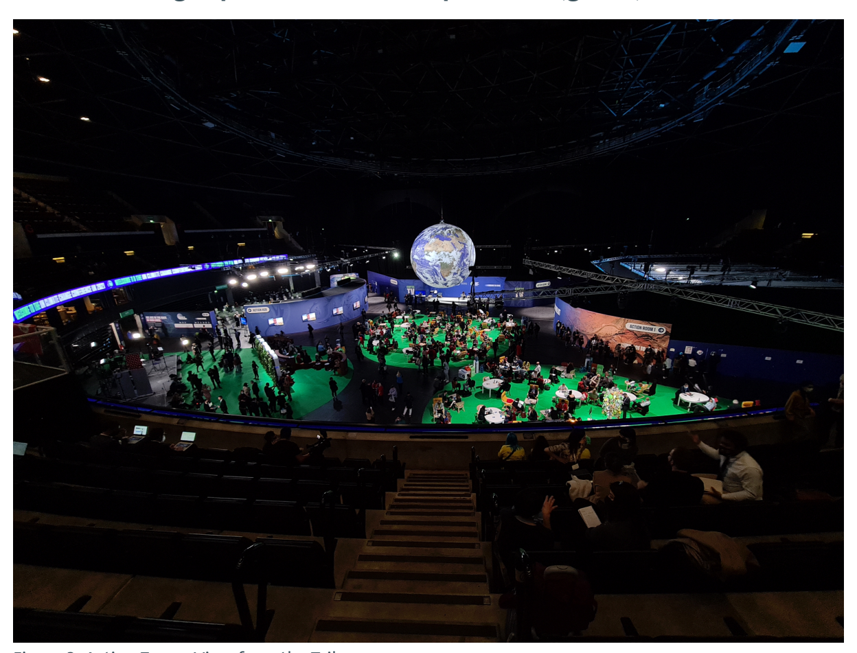
Figure 3: Action Zone - View from the Tribunes