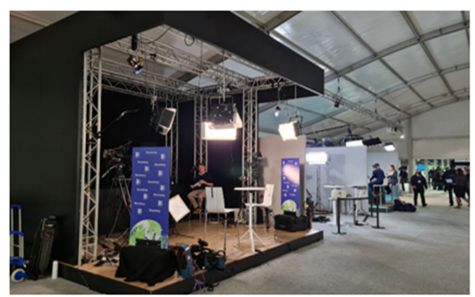
Figure 1: Site Map Blue Zone, Subway Billboard, Broadcast Studio in the Negotiations Area

When entering the conference area after having passed a range of billboards in the subway reading "The world is looking to you, COP26" and the queues at the UN security check, the participant could easily experience a moment of dizziness when trying to understand the site map and locate a side event or negotiation room in the hallways and hangars of the Glasgow Conference Centre. On the right side after the entrance was the shiny Climate Action Zone (see part 2), whereas the left led into a neatly designed space with a food court and huge flat screens displaying low-carbon advertisements, as well as the pavilions of countries, international organisations and private climate networks. The negotiation rooms were located further along, in another complex. Here, the atmosphere was much more sober and functional, featuring neither ornaments nor big colourful screens. Instead, a carpeted floor dampened the footsteps of busy delegates running from one meeting to another, observers trying to obtain a seat in one of the informal meeting rooms, and journalists waiting in the hallways to catch a minister or head of delegation for a brief interview or recap of the latest geopolitical quarrel. Only the main plenary hall, an immense hangar with hanging screens, arranged in simple UN style, conveyed some sense of ceremonial grandeur.