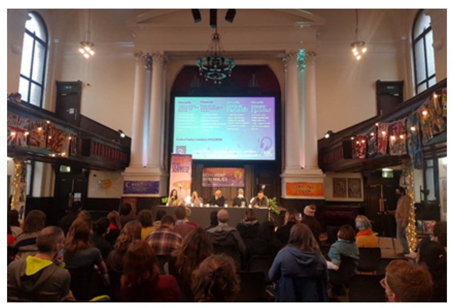
Figure 9: Debate, People's Summit for Climate Justice at Adelaide's Place

sought to monitor and hold the proceedings to some level of accountability: for example, when members of XR held up large eyes at the entrance of Glasgow Central Station, to "watch" delegates exiting station. Again, dramatic stunts like this have (at least) two purposes, with another target being increased media exposure for such an event.