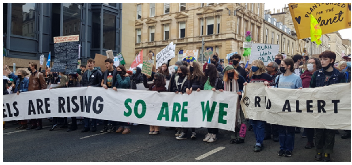
Figure 8: Friday march on the first conference week, streets of Glasgow

Much of the civil society activity on the 'Fringe' was organised within and around the COP26 Coalition and the so-called Climate Fringe. These organisations had intended for a central space near the Blue Zone to act as a main civil society hub, but their plans were thwarted at a late stage, just over a month before the start of COP. This led to a last-minute effort to rent various venues, meaning that civil society actors and activities were distributed across Glasgow without one singular place large enough for everyone to gather. Instead, there were multiple sites that acted as key venues, notably the Landing Hub, located in the vicinity of the Blue Zone, and Adelaide Place Baptist Church (with a maximum capacity of 220). These stages were arranged to serve multiple purposes. In contrast to its UN counterpart, the Landing Hub's art installations, wood chip-floored tents and Portaloos gave it a festival-like feel. The need to produce and proliferate social media-friendly content was satisfied by work from Scottish artist Robert Montgomery, with his "Grace of the Sun", an enormous poem constructed from solar lamps, acting as a focal photo opportunity for