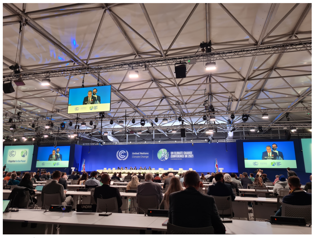
Figure 2: Plenary Pen y Fan