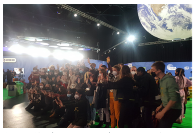
Figure 6: Fridays for Future press conference, Action Hub

The wide range of activists attracted to the conference, from traditional actors<sup>13</sup> civil society like environmental NGOs to activists pushing for more radical climate action, congregated in the COP26 Coalition, a heterogeneous body of nearly 200 organisations. 14 This coalition, much like movement previous coalitions comprised a broad range of goals and strategic approaches. Observers previously suggested typology of moderate 'insider' and more radical 'outsider' groups,