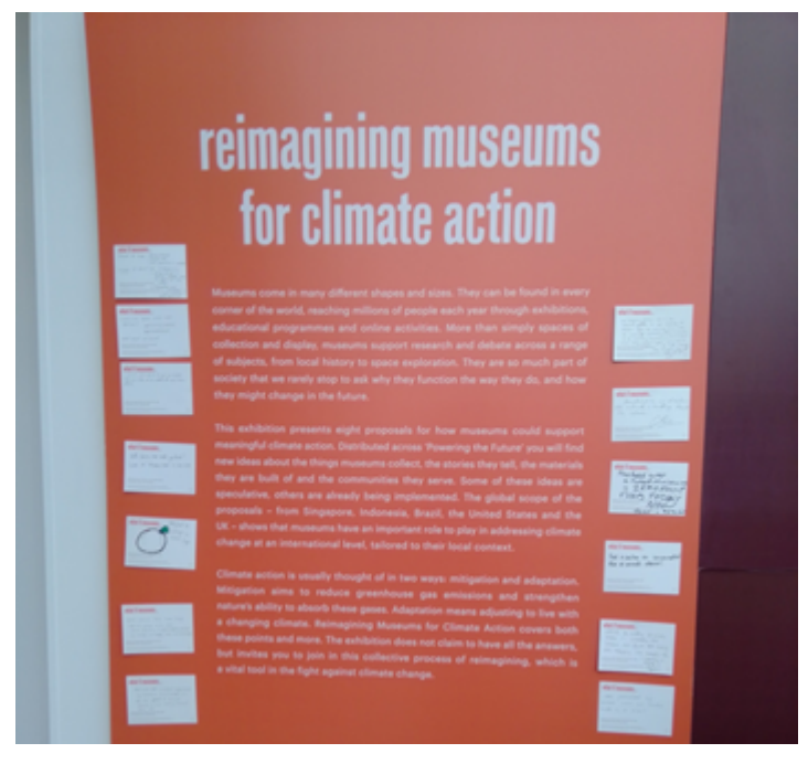
Figure 5: Participatory exhibit at the Science Centre

Various features highlighted the location's primary function as a museum. One of the upper floors was dedicated to an interactive exhibit inviting visitors to reflect on how to "reimagine museums for climate action" (pinning notes on a board). Furthermore, the choice of a museum for the Green Zone emphasised the function of staging and performance throughout the COP venues, as underlined previously for the Blue Zone.