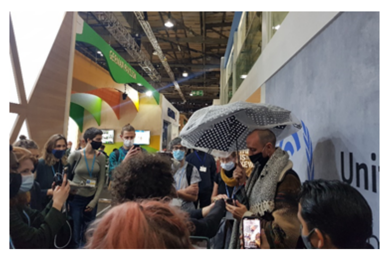
Figure 7: Activists performing a "Toxic Net Zero Tour"

If anything, this issue was more pronounced at COP26. An analysis of the messaging guides, movement calls and press releases before the COP showed a range of positions, from rather moderate to radical outsider. The COP26 Coalition and Extinction Rebellion (XR) declared the failure of COP26 before the conference had even begun, accusing the UNFCCC process of "mass manslaughter by gross negligence". These accusations were formulated as a charge sheet, signalling a lack of hope in the process. On the other hand, groups like Stop Climate Chaos Scotland (SCCS), a civil society network in Scotland, which was heavily involved in setting up an activist network called "Climate Fringe", took a more constructive stance towards the process and acknowledged some steps in the right direction, e.g., by the Scottish government.