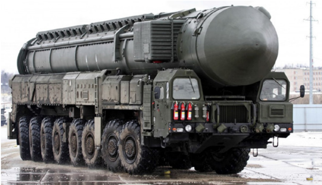
Picture: Russian ICBM (RS-24). Link: http://nationalinterest.org/blog/the-buzz/russias-new-rs-28-sarmat-icbm-us-missile-defense-killer-19464 No changes made.

Some observers have expressed concern that China, which possesses a nuclear arsenal of approximately 260 total nuclear warheads and 75 intercontinental range delivery systems, could soon increase the alert level of its forces, deploy nuclear-armed cruise missiles, continue to MIRV its ballistic missiles, and perhaps even abandon its no-first use declaratory policy. 13 This, combined with advances in U.S. missile defense and conventional strike capabilities, could spiral into an arms race between the two countries and possibly with Russia and increase the risks of a nuclear crisis.