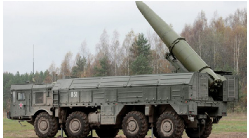
Picture: Iskander-M (SS-26). Link: http://missiledefenseadvocacy.org/missile-threat-and-proliferation/missile-proliferation/russia/iskander-m-ss-26/ No changes made.

In addition, Russia appears to be putting greater emphasis on nuclear weapons in its overall national security policy and reverting to dangerous Cold War rhetoric and veiled nuclear threats. Moscow is also building new nuclear capable systems that are not covered by or violate existing arms control treaties, such as new sea-launched and ground-launched cruise missiles. U.S. and NATO officials have also expressed concern that Russia is lowering the threshold for when it might consider using nuclear weapons, increasing the risks of escalation early on in a conventional conflict.