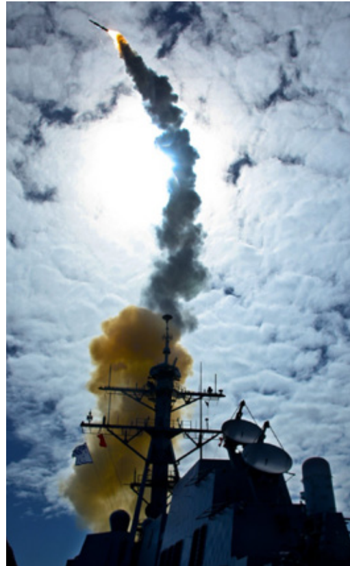
Picture: A Raytheon SM-6 launched from an Aegis guided missile destroyer. Link: https://news.usni.org/2015/11/27/aegis-ashore-in-romania-set-for-dec-31-lightoff-bmd-sm-6-nearing-full-fielding (Photo: US Navy)

It remains to be seen how the Trump administration will approach the arms control relationship with Russia. The administration is conducting a Nuclear Posture Review that is examining U.S. nuclear policy and strategy. The review is scheduled to be completed by the end of the year. While the president has said that global nuclear weapons inventories should be significantly reduced, he has also pledged to strengthen and expand U.S. nuclear capabilities, denounced New START, and reportedly responded negatively to Putin's suggestion in a January phone call to extend that treaty. 5