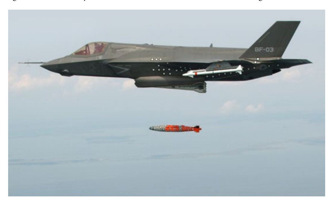
120808-O-GR159-003, Naval Air Station Patuxtent River, Md. August 8, 2012) F-35B test aircraft BF-3 completing the first aerial weapons release for any variant of the aircraft.

While nuclear weapons are forgiving due to their broad effects, precision conventional systems cannot afford a breakdown in the performance of their critically important supporting cast if they are to succeed as planned.