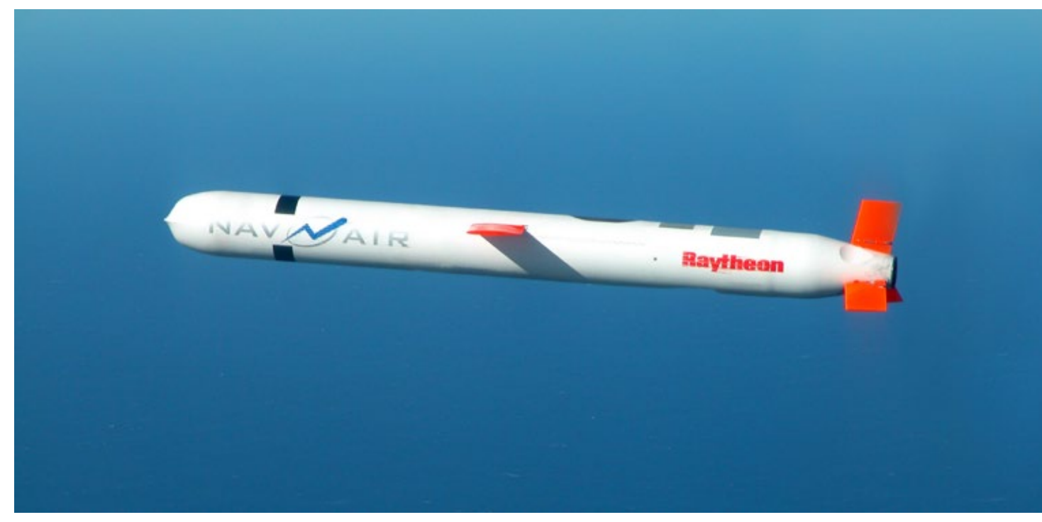
021110-N-0000X-003 China Lake, Calif. (November 10, 2002), a tactical "Tomahawk" Block IV cruise missile, conducts a controlled flight test over the Naval Air Systems Command (NAVAIR) western test range complex in southern California.

China's economic challenges, including dealing with access to clean water, remuneration costs related to environmental degradation, rampant corruption, potential divisiveness between urban and rural populations, and ethnic and religious unrest. Complicating matters further are continued growth in chronic diseases coupled with inevitable demographic changes that China faces stemming from its one-child policy. Combined, these latter two developments will place stiff demands on China to cope with an aging population and a substantially diminished younger age cohort. In the end, how China addresses slower growth, rising financial demands, and internal security challenges, which have already elevated the cost of security to exceed that of defense spending, will ultimately contribute importantly to shaping the comparative quality of China's military ambitions.8