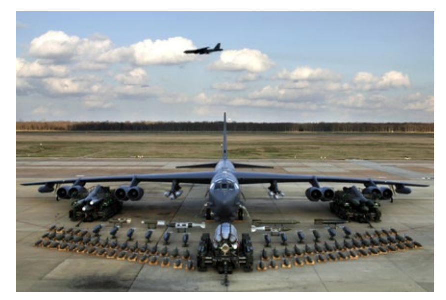
© 2006 Robert J. Horstman, U.S. Air Force/DoD: 060202-F-6809H-100, Barksdale Air Force Base, La. (AFPN), munitions on display show the full capabilities of a B-52 long-range bomber.

Simply put, this joint force endeavor is an enormously daunting execution task, whether for China or Russia. Once the war begins chaos and complexity commence. It is commonplace to underestimate C4ISR, which the Chinese have only recently begun to take seriously from a joint-force standpoint. As retired U.S. Navy Captain Wayne P. Hughes argues in his classic book Fleet Tactics: Theory and Practice, "The art of concentrating offensive and defensive power being complicated, it is easy to exaggerate the potential of the enemy to master it." Keep in mind, too, that Hughes was referring only to a naval engagement, not truly multi-service operations, as would be the case with such an air operation example as discussed earlier.