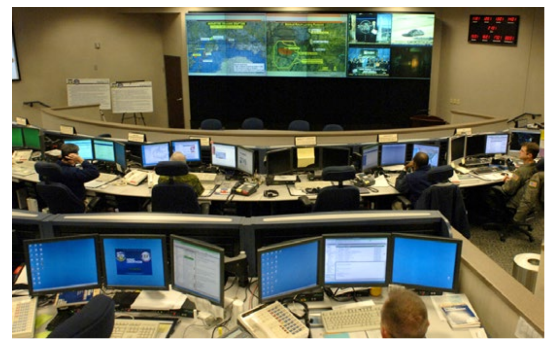
© 2006 Shane Wallenda, U.S. Navy/DoD: 060119-F-ZZ000-001, Colorado Springs, CO - U.S. Northern Command Joint Operations Center

Russia remains behind the United States in advanced conventional offensive and defensive capabilities. After the Vietnam War the United States began focusing on what became, in effect, a revolution in conventional strike operations. Taking nearly a decade and a half, the U.S. military exploited the then-emerging progress in precision guidance, advanced communications, and sensors and developed appropriate doctrines, tactics, and procedures, which became central to the success of the 1991 war with Iraq. Although very few precision-guided munitions were employed against Iraq in 1991, the ones used demonstrated an order of magnitude improvement in effectiveness compared with dumb bombs.5