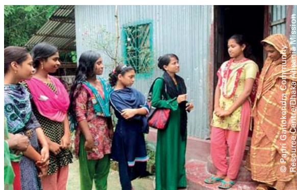
Ganokendra community action group on prevention of early marriage in Bangladesh

For community learning centres to be both sustainable and replicable, legal frameworks are needed for the centres and for their staff, as well