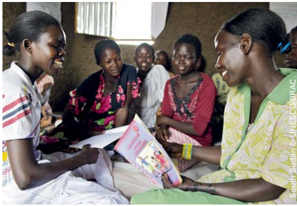
Adolescent Girls' Club in South Sudan

community. Local people – leaders, school teachers and affected citizens – play active roles in the day-to-day management and organisation of the centres. Many of them work on a voluntary basis to serve the community, which may range in size from a village to a district. Staff are recruited locally so they know the people, their language, culture and living circumstances. The centres are located in key community venues, such as primary schools, village administration offices, places of worship, or in their own dedicated premises. Successful community learning centres are embedded in the community they serve.