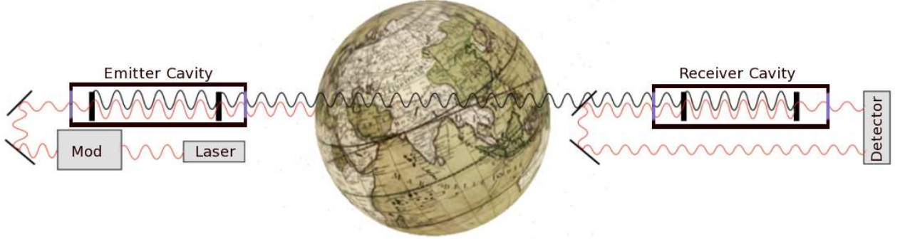
Figure 2: Sketch of the HP communication system. A laser modulated in amplitude or polarization feeds a resonant cavity placed inside a vacuum tube. A fraction of the power inside the cavity oscillates into hidden photons that being weakly interacting scape the cavity and can traverse dense media without losing information. The receiver is another cavity in vacuum locked to the frequency of the HP signal. HPs resonantly reconvert into photons that are finally detected at both the receiver cavity ends.

The emitted hidden photons can traverse any dense medium without significant losses. The hidden photon absorption length in a dense medium with photon absorption length l_\gamma can be estimated as follows (see, for instance [19])