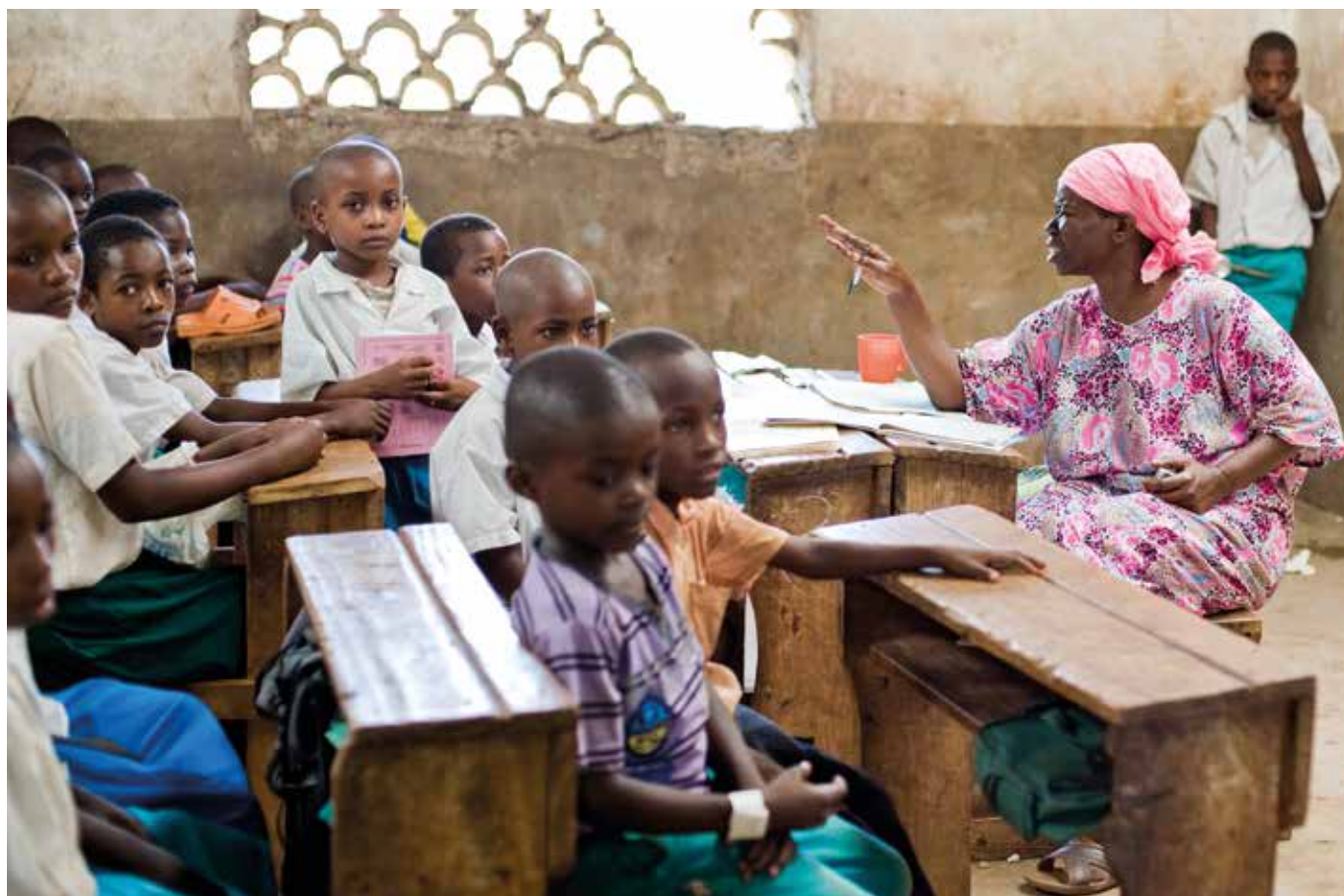
Young students at a primary school in Kenya

'Modality of delivery' relates to the transfer of knowledge and skills in various settings, such as formal, non-formal and informal. It should be noted that the distinction between these three modalities becomes fluid in the contemporary world. 'Formal education' is traditionally perceived as the state-run education system, designed and implemented by the government, and by authorized and recognized public and private institutions. Generally, formal education consists of basic education programmes, tertiary education and some parts of adult education – such as further education programmes that lead to formal certificates (UIS, 2012). Furthermore, formal education encompasses all age groups and a range of programmes that should adjust their content and teaching methodology according to the needs of learners, their backgrounds and their aspirations.