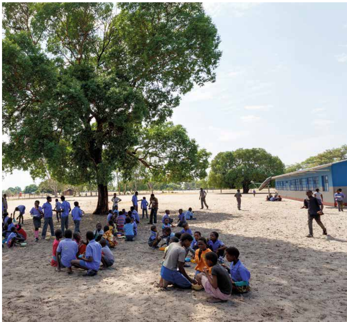
Namibian school children waiting for their lesson to start