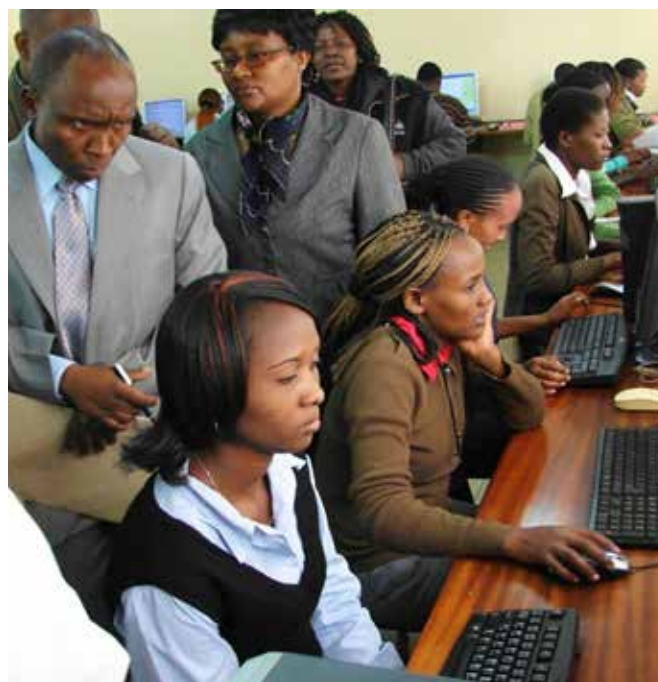
Adult learners improve their digital skills at the St Peter Clavers Adult Education Centre in Nairobi

Early childhood development and education policies target children aged between four and five to nurture strong learners from the very start of their lives and prepare them for school. Children who receive effective education in early childhood are more likely to start school at the proper age and are less likely to drop out. The Ministry of Education analysed the challenges in early childhood education and found that standards and quality were low due to a lack of the infrastructure needed for the holistic development of a child, and to an irrelevant curriculum that focused on cognitive learning and did not apply a learner-centred approach (ibid.). To address this, a semi-autonomous Education Standards and Quality Assurance Council (ESQAC) was set up under the cabinet secretary to monitor standards in education and training offered by all providers across the country. The ESQAC will contribute to the development