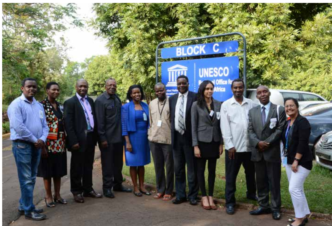
Directors of adult education and senior education specialists at the policy dialogue workshop in Nairobi, Kenya, in February 2017

Fruitful cooperation with all those mentioned above enabled this research to be conducted and helped produce this publication, which we hope will contribute to the advancement of lifelong learning throughout the participating African countries.