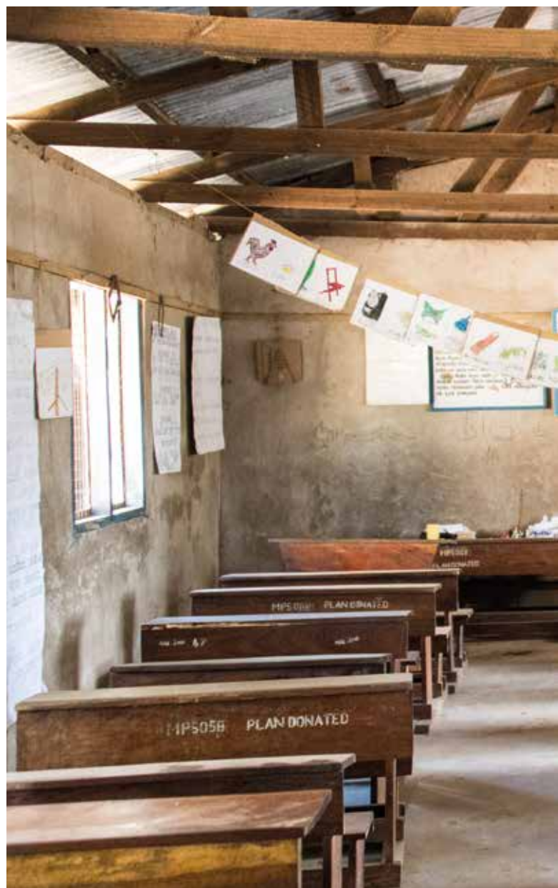
The Mlandizi Primary School in the United Republic of Tanzania

The Education Sector Development Programme 2008–2017 (Government of the United Republic of Tanzania, 2008) advocates the establishment of links with civil society organizations and the private sector for the provision of high-quality education and training that corresponds to the needs of citizens and the labour market. These partnerships are aligned with the National Youth Development Policy (Ministry of Labour, Employment and Youth Development, Tanzania, 2007), which promotes learning opportunities for youth through flexible non-formal and continuing educational