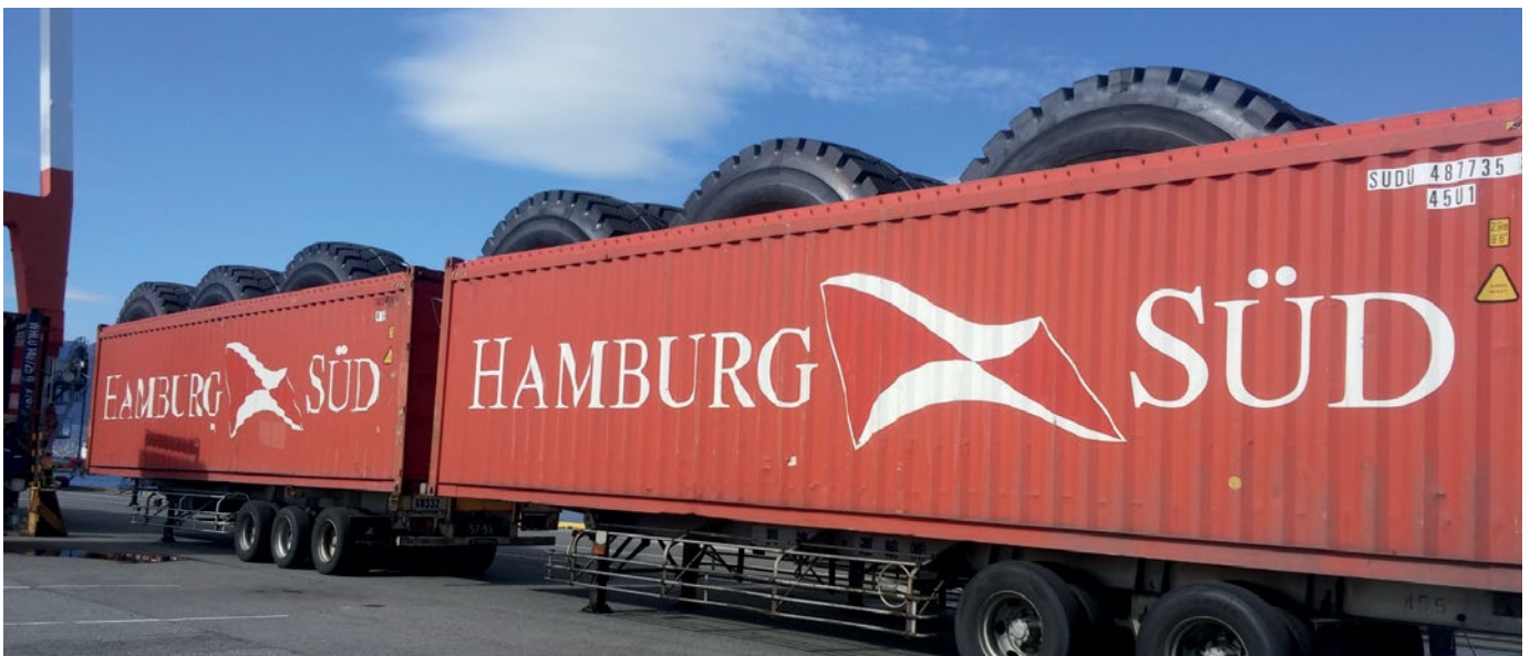
40' High Cube Open Top container loaded with mining vehicle tires for South America