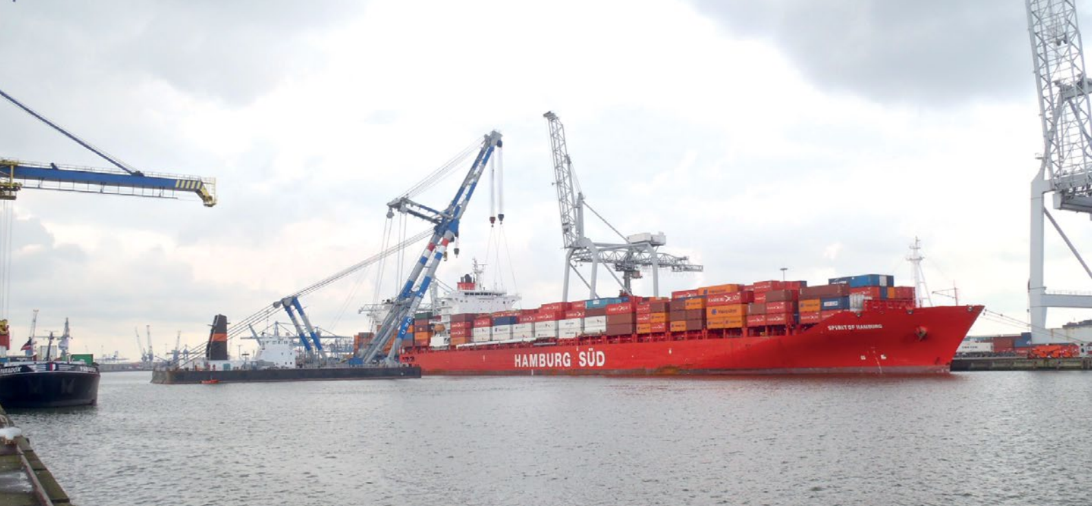
Our vessel "Spirit of Hamburg" in the port of Rotterdam during the loading process, assisted by a floating crane