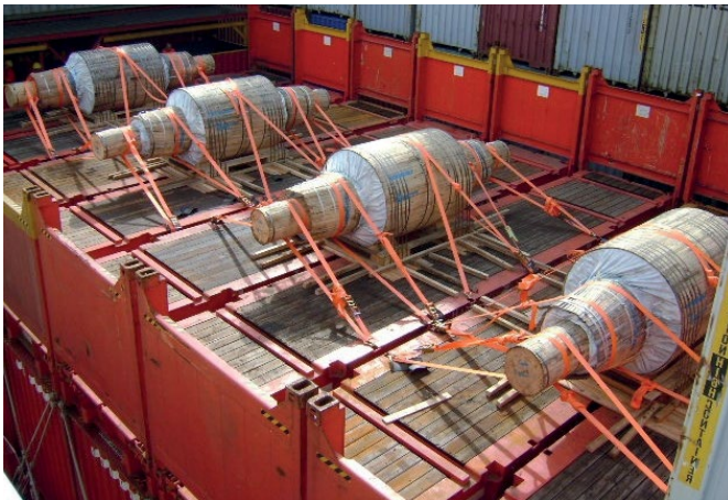
Individual solutions for our customers

Hamburg Süd is a quality carrier operating 130 container ships with a total slot capacity of approximately 600,000 TEU and around 50 liner services. With more than 250 offices worldwide and competent, as well as passionate employees on-site, we are close to our customers' business around the globe and ensure that they receive logistics solutions tailored to their individual needs.