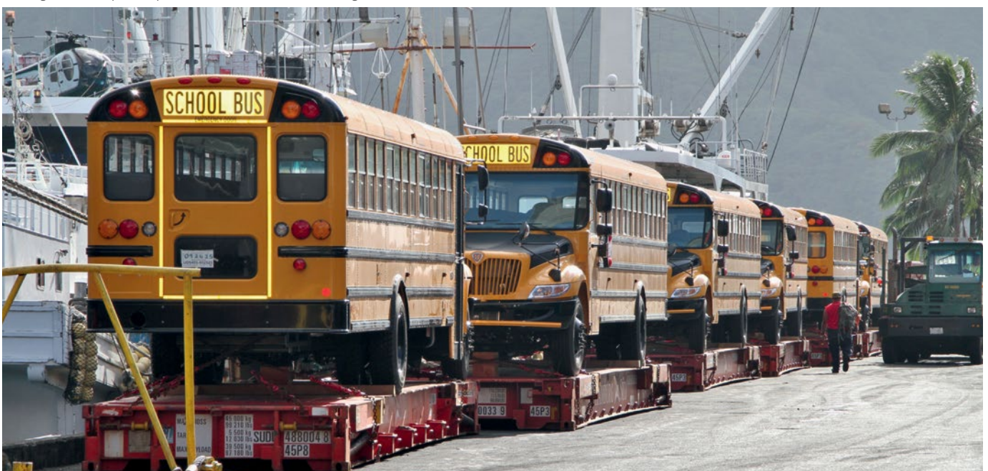
40' Flat Rack container with school buses loaded for shipment from Long Beach to Pago Pago