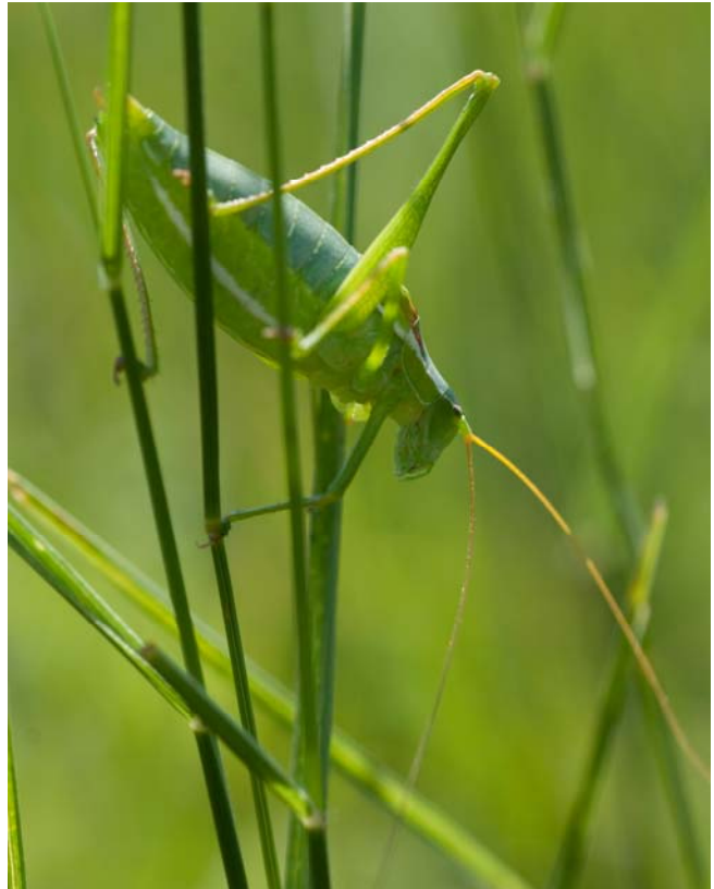
Poecilimon sp. , Transylvania, Romania.

Bull. Eur. Dry Grassl. Group 9 (December 2010)