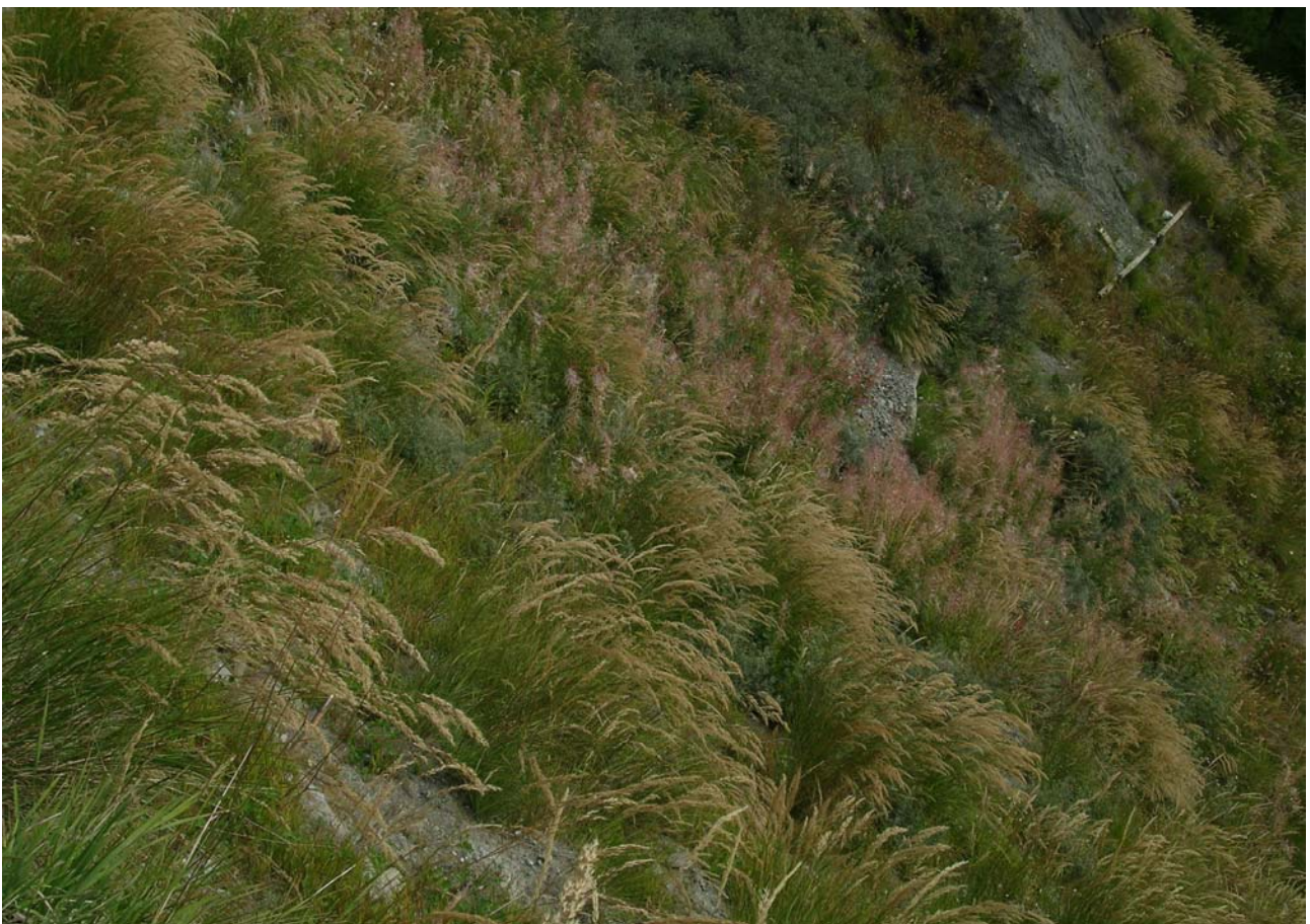
Fig. 7 Dry grassland dominated by Koeleria macrantha and Achnatherum calamagrostis with Hippophae rhamnoides in the Alps.