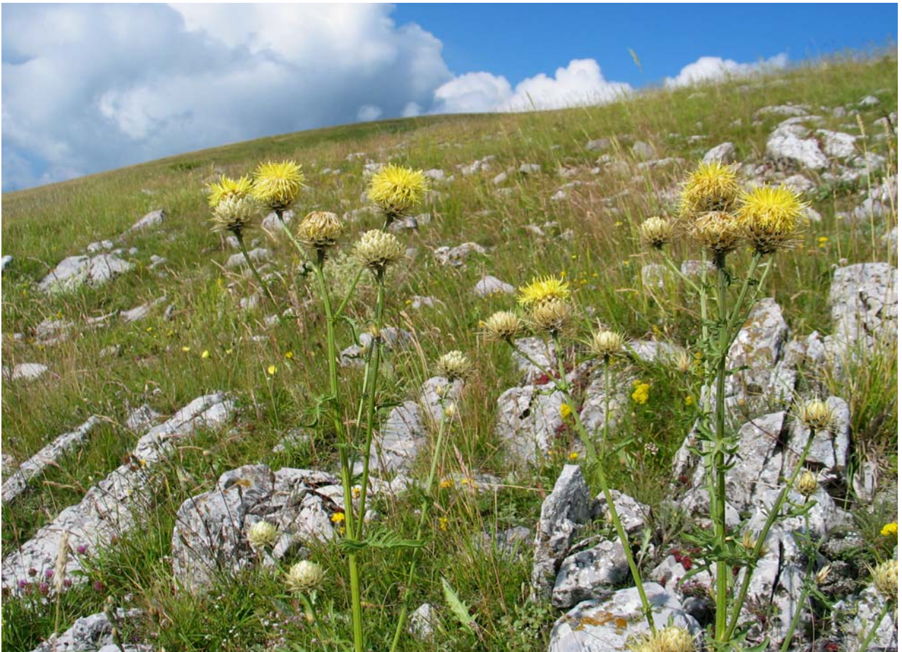
Centaurea chrysolepis on dry calcareous slopes of the Vratsa Mountain.