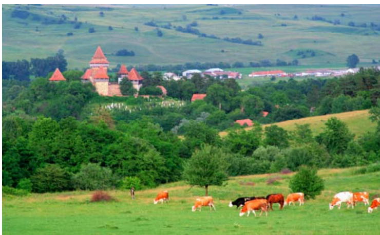
Bull. Eur. Dry Grassl. Group 9 (December 2010)

The pastures and meadows are distinguished by law as well as by traditional management. Rising sheep numbers and rapidly falling cow numbers have disrupted this distinction, a significant factor in maintaining the efficient management and rich biodiversity of the grasslands. In autumn the flora showed but little of its summer glory,