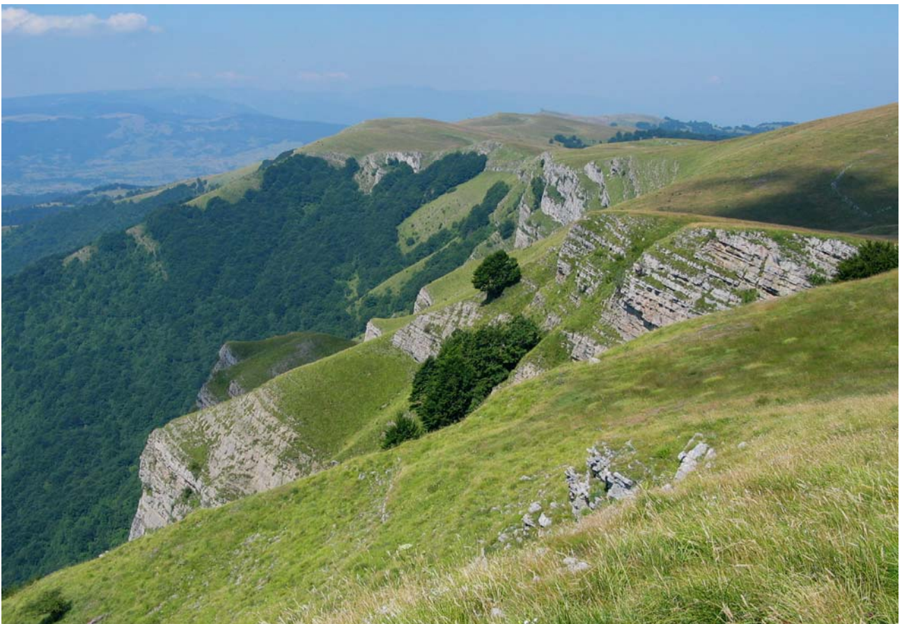
View from the Vratsa Mountain.