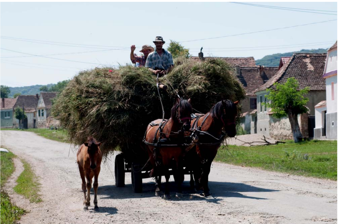
Traditional haymaking in southern Transylvania, Romania.