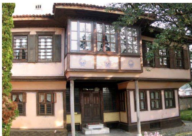
Grasslands in the area of Sredna Gora Mountain and accommodation place in 19th century house in Koprivshtitsa.