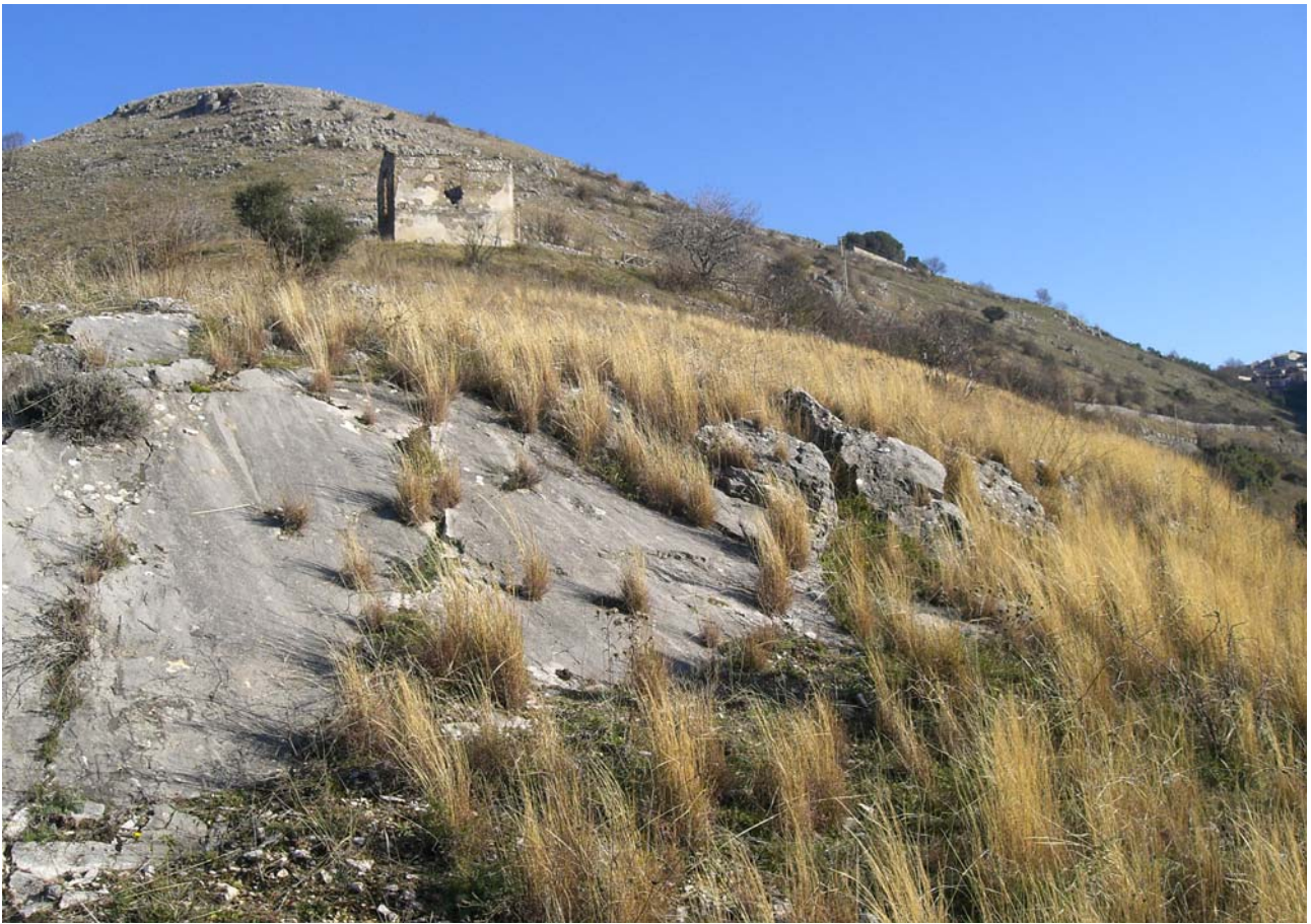
Fig. 6 Hyparrhenia hirta community in central Italy.