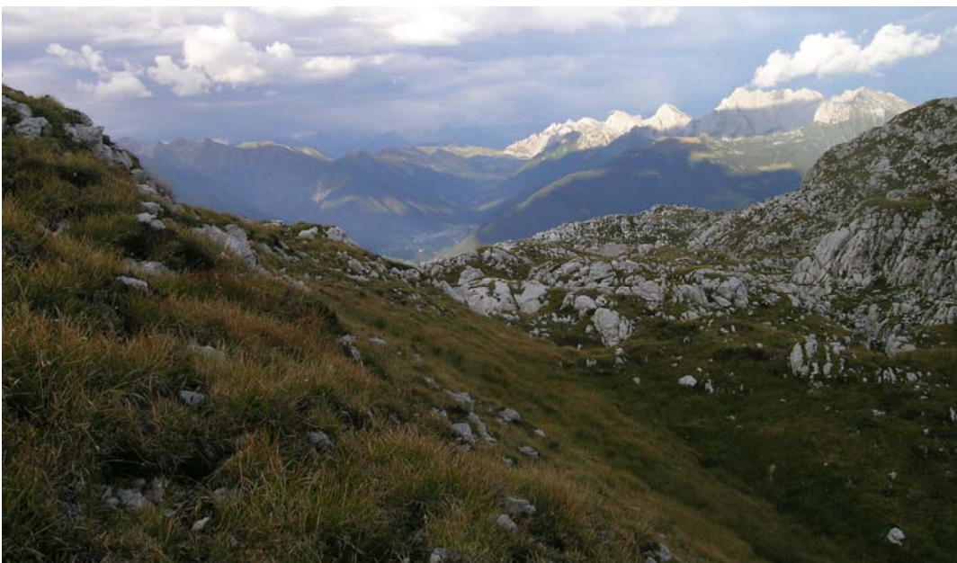
Fig. 4 Carex firma dominated community in the Pre-Alps, Photo: M. Caccianiga.