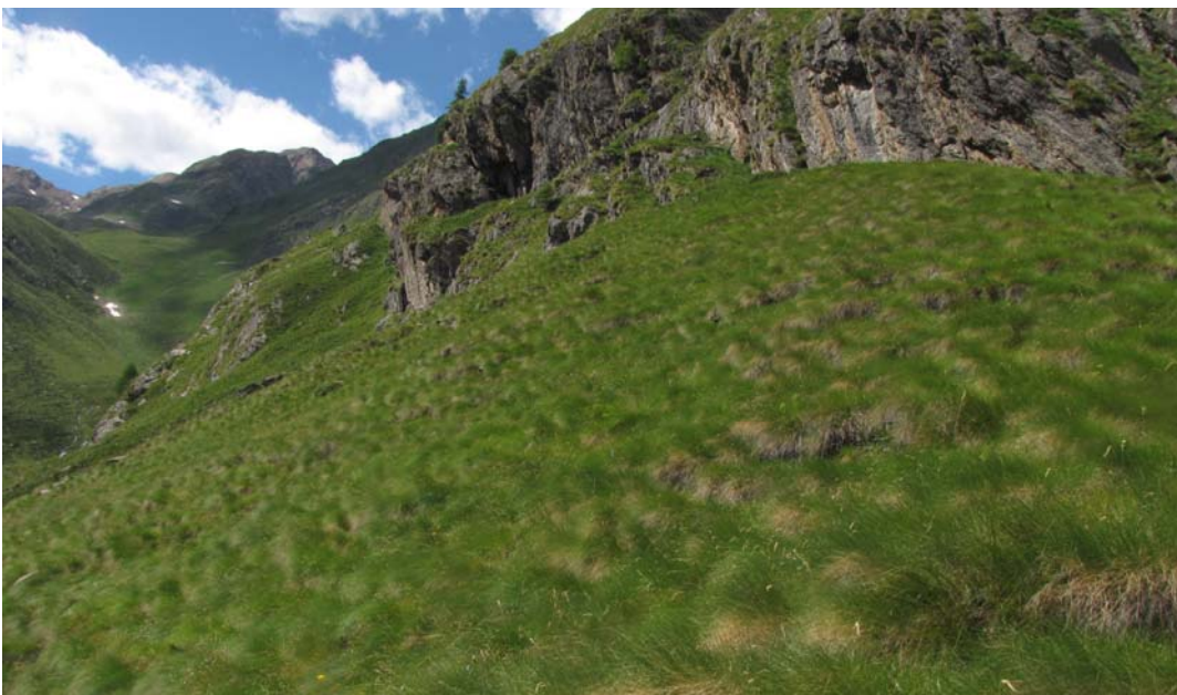
Fig. 3 Festuca lueddii ( Festuca varia complex) dominated grassland in the Alps.

In Italy the following sub-types can be identified of which the former can be referred to the class Salicetea herbaceae , while all the others to the class Elyno-Seslerietea : i) Boreo-Alpic calcareous snow-patch communities ( Arabidion coeruleae , Salicetalia herbaceae ); ii) closed calciphile alpine grasslands ( Seslerietalia caeruleae , Seslerion coeruleae , Caricion austroalpinae , Caricion ferrugineae ); iii) wind edge naked-rush swards ( Oxytropido-Elynion , Elynetalia myosuroidis ); iv) calciphilous stepped and garland grasslands ( Seslerion apenninae , Seslerietalia tenuifoliae ); v) oro-Apennine closed grasslands ( Ranunculo pollinensis-Nardion strictae , Nardetalia strictae ); vi) oro-alpine turfs, more or less continuous ( Seslerietalia coeruleae , Caricion firmae ; Fig. 4).