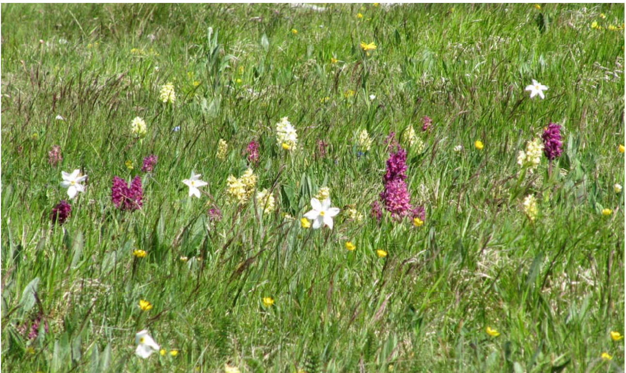
Fig. 5 Bromus erectus dominated grassland rich in orchids, central Italy.

The species that characterize the perennial communities are: Lygeum spartum , Brachypodium retusum , Hypparrhenia hirta (Fig. 6), Bituminaria bituminosa , Avenula bromoides , Convolvulus althaeoides , Ruta angustifolia , Stipa offneri , Dactylis hispanica , Asphodelus ramosus ; or Poa bulbosa for the subnitrophilous communities. In the annual communities the species most frequently found are Brachypodium distachyum (= Trachynia distachya ), Hypochoeris achyrophorus , Stipa capensis , Tuberaria guttata , Briza maxima , Trifolium scabrum , T. cherleri , Saxifraga trydactylites .