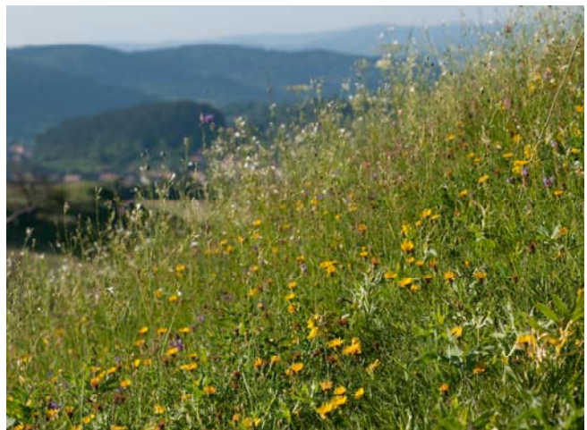
Brachypodietalia pinnati community in the Southern Transylvania, Romania.