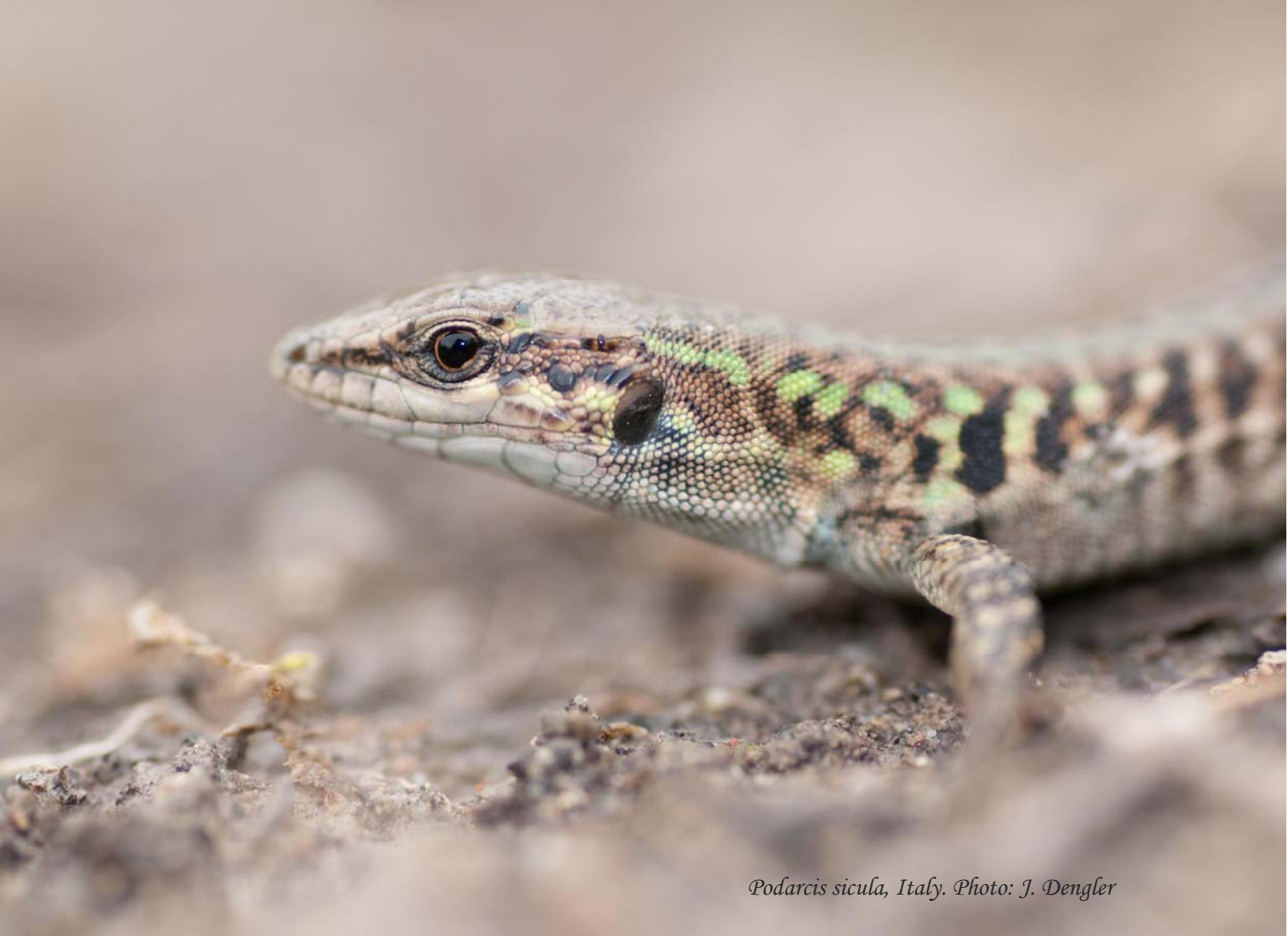
Podarcis sicula, Italy.

Bulletin of the EDGG , official organ of the European Dry Grassland Group (EDGG), ISSN 1868-2456