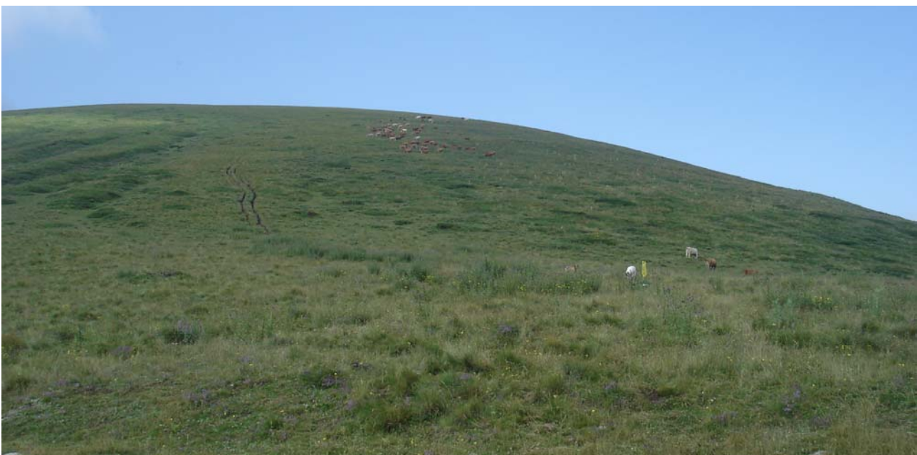
6230 Species-rich Nardus grasslands on siliceous substrates in the Mount Varnous.