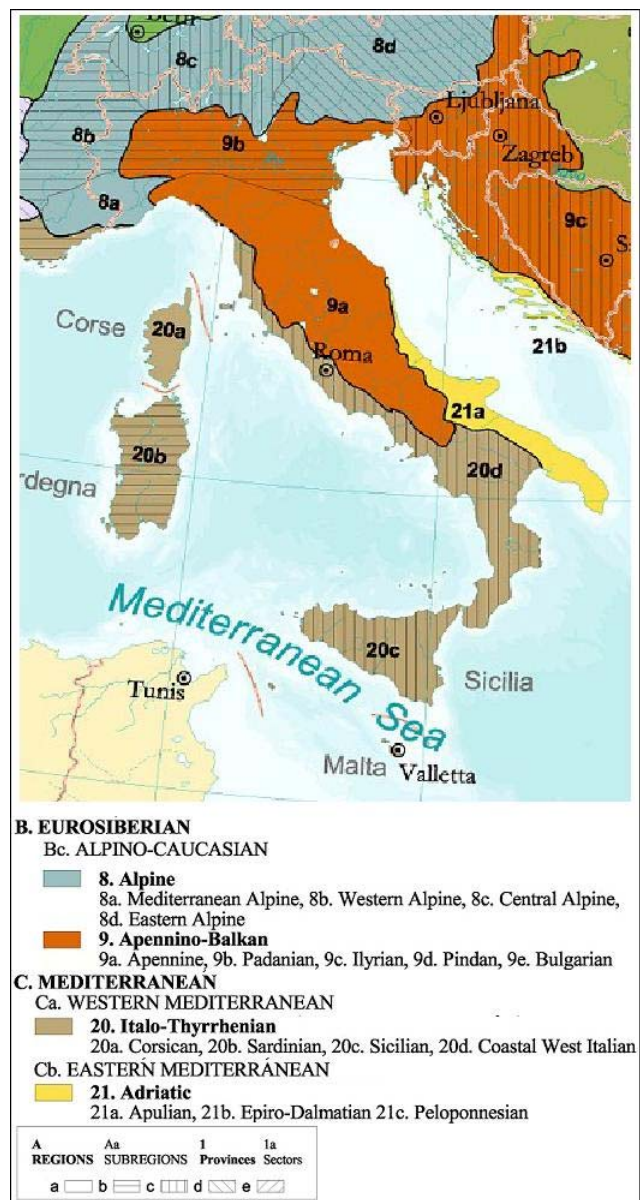
Fig. 2. Part of the biogeographic map of Europe (Rivas-Martínez et al. 2004).

Differences in dry grassland types reflect coarsely also the biogeographic gradients that can be found in the country and led the authors of several European and Italian biogeographic maps (Rivas Martínez et al. 2001; ETC-BD 2006; Giacomini 1958; Pedrotti 1986; Blasi et al. in press) to draw the limit between the Eurosiberian and Mediterranean biogeographic regions in the Italian peninsula (Fig. 2).