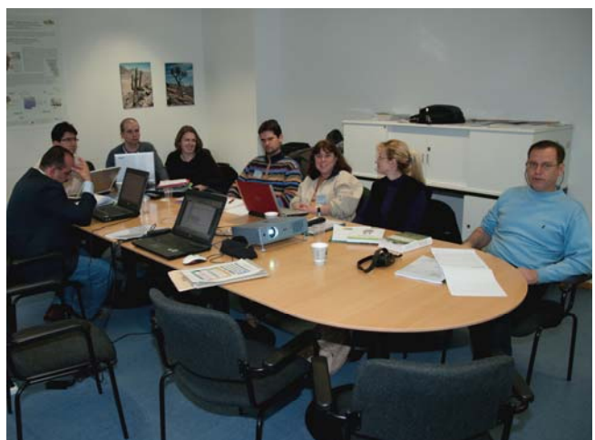
Kick-off workshop for the SE European Dry Grassland Vegetation Database in Hamburg, Germany.