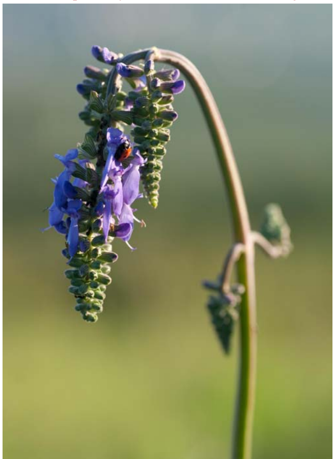
Salvia nutans, Transylvania.