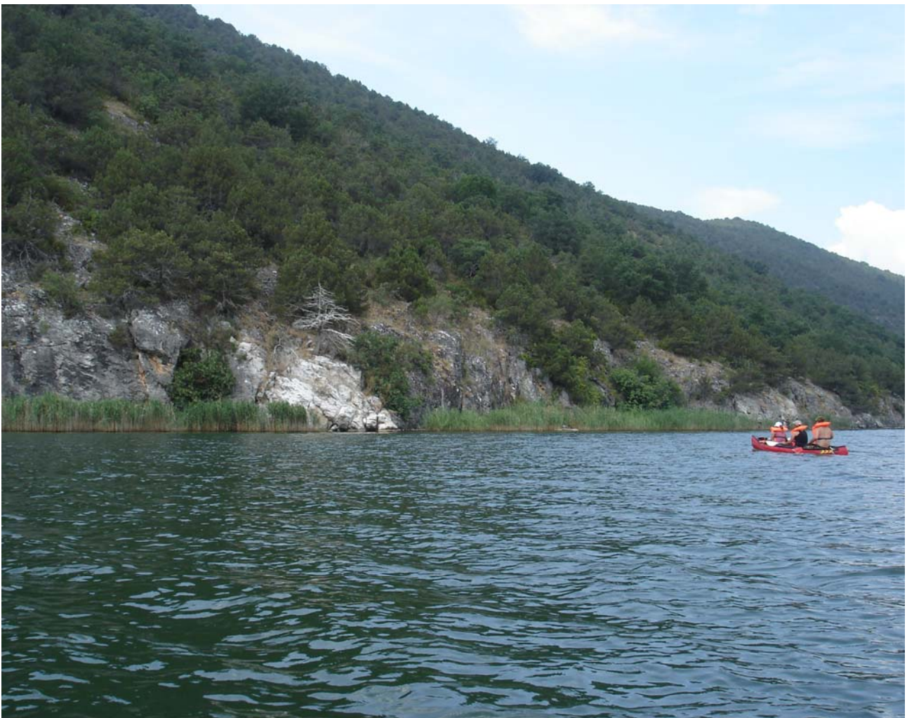
9562 Grecian juniper (Juniperus excelsa) woods on limestone and 72A0 reed beds in the west shore of Lake Micro Prespa, Greece.