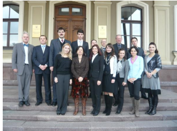
The participants of the CORE Chairmanship Training in Kyiv.

OSCE Chairmanship Task Force. It aimed at a better understanding of how to build consensus among participating States and was meant to explain specifics of the Organization’s structures and the OSCE’s strategic and daily management, as well as to communicate expertise in formal and informal OSCE decision-making and implementation procedures.