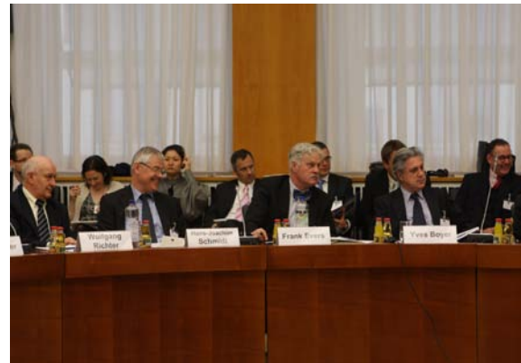
A group of participants at the IDEAS Workshop