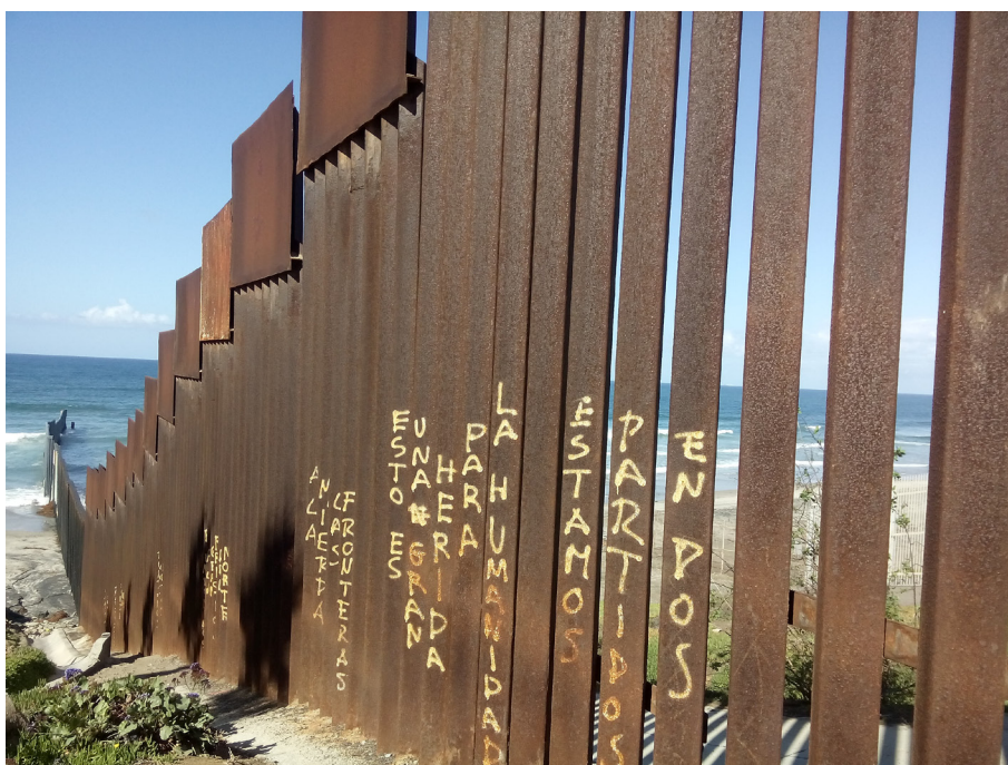
Border on the Mexican side, Tijuana, Baja California Norte, Mexico