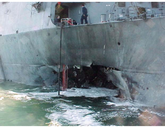
USS Cole after Terror attack, Source: DoD photo (2000)

period it is relatively small. Despite strong variations in the number of attacks over time, their frequency and the number of victims have been rising. These numerical trends, combined with repeated threat and potential impact of an attack, should lead to heightened attention and stress the importance of governance. Nationalist-separatist and Islamic groups have initiated the most attacks to date; assaults by Islamic groups have created the most victims in recent years. The participation of different perpetrator groups makes a general overview of maritime terrorism as a whole impossible and multi-dimensional analvsis essential.