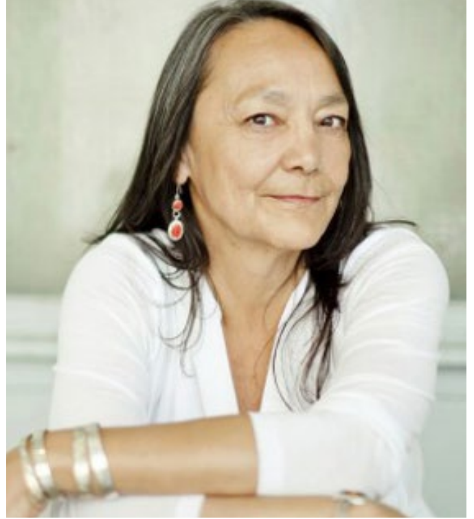
Tantoo Cardinal received the first August Schellenberg Award at the imagineNATIVE Film + Media Arts Festival.