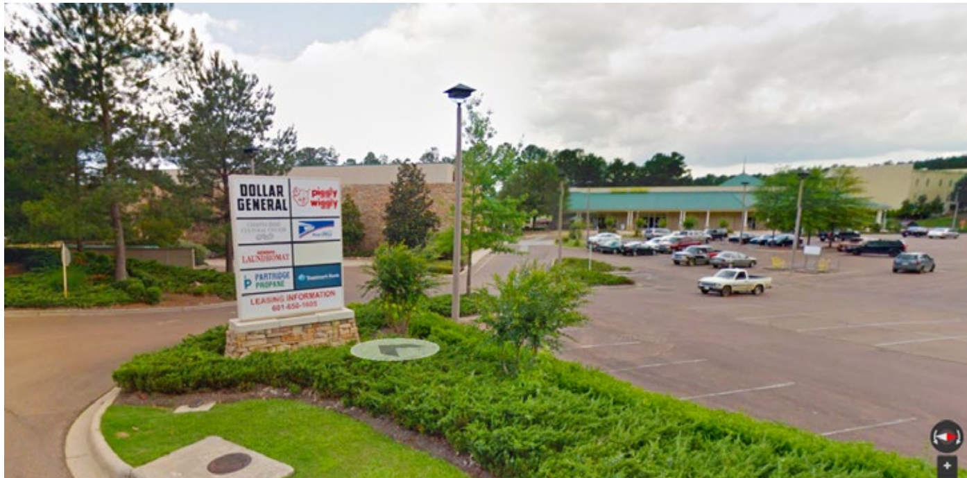
The Dollar General Store on the Choctaw Indian Reservation has become a flashpoint of tribal governance.

For tribes, a 'potentially devastating case' is in the making BY SUZETTE BREWER