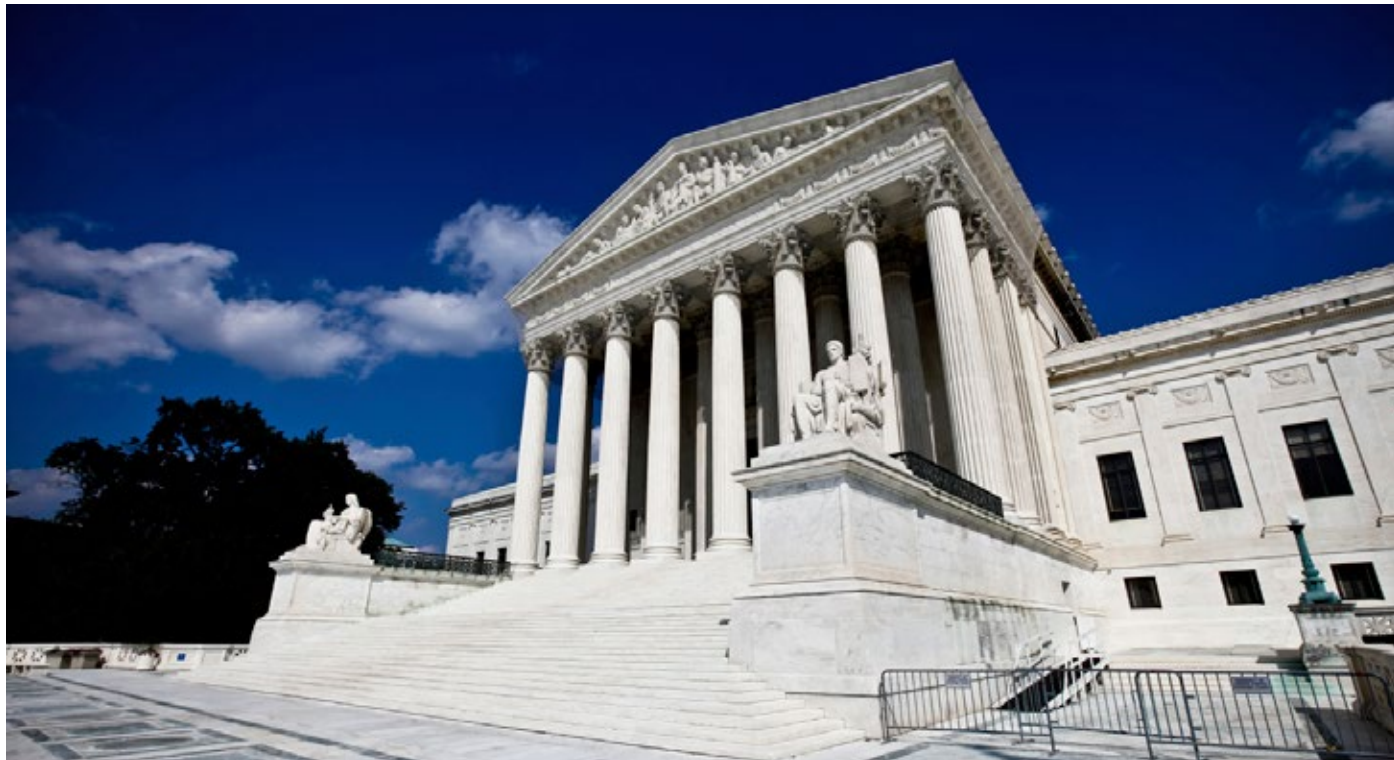
On December 7, the Supreme Court is expected to hear the “most potentially devastating case for Indian tribes in half a century.”

in a business located on tribal land on a reservation is attempting to regulate the safety of the child’s workplace,” the court ruled. “Simply put, the tribe is protecting its own children on its own land.”