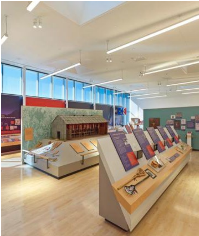
After 30 years and $15 million, the Seneca Art and Culture Center has opened in Ganondagan, New York.