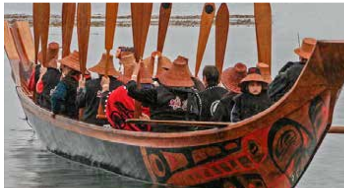
Canoes off Haida Gwaii during the Pacific Asia Indigenous conference spotlighted the boom in British Columbia First Nations tourism.