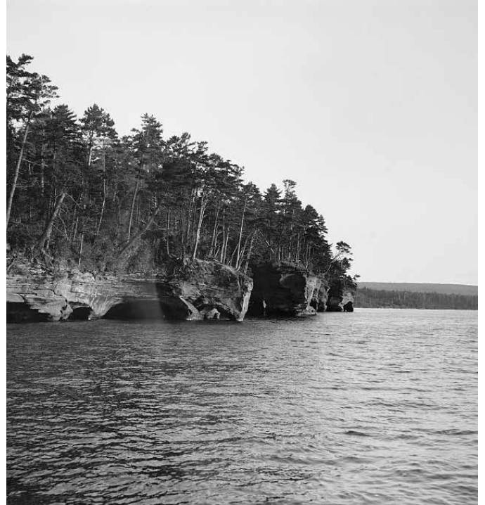
A name change is contemplated for Squaw Bay in the San Juan Islands off Washington State.