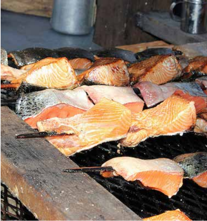
Tribes in Washington are hailing a new federal assessment of the state's fish consumption rate.