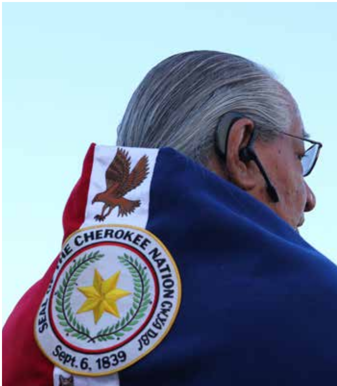
Cherokee activist Jess Sixkiller was murdered on September 25, the victim of an apparent home invasion.