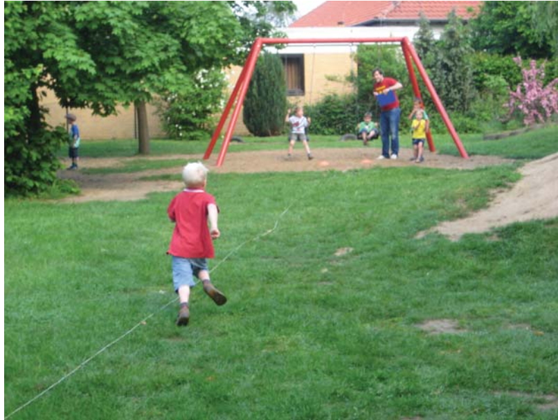
Figure A.2: Children during the task