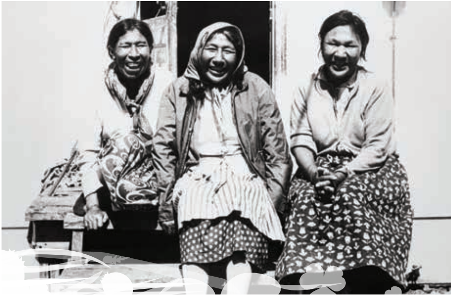
“Three Inuit midwives, Wassagamack., August 1970.”

A midwife is the keeper of ceremonies for young people like puberty rites. She is a leader and mentor, someone who passes on important values about health to the next generation.