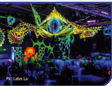
Pic: Labis La

new talents and upcoming djs, while also going for massive decoration, inviting Flow-ers of Life, Vortex, BOTN and others!