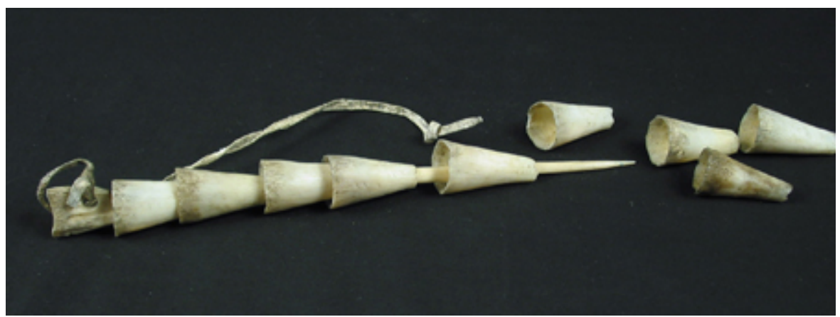
Inuit Cup and Pin game

The organization chart on the following page outlines the structure of the Secretariat.