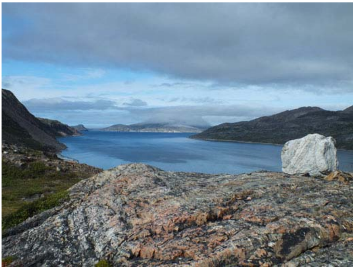
Rose Island, Saglek Bay, Torngat Mountains National Park, Labrador

The Secretariat, in consultation with responsible departments, continued to work with the Federal Government and the Innu to develop Innu capacity and plan for income support and child, youth and family services devolution.