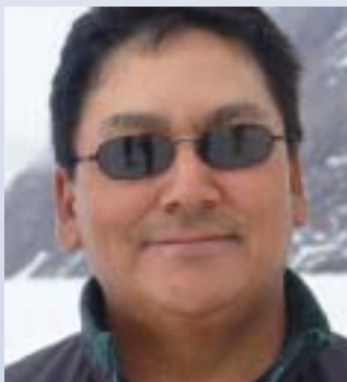
ጠቅላይ ጠቅላይ ጠቅላይ ቤት Ex Officio, Nunavut Trust Vutilimaittug, Nunavut Trust