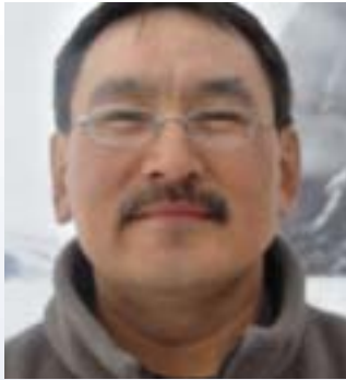
የቡናፕ ልዩ ልዩ ጠቅላይ ቤት Kitikmeot Inuit Association Kitikmeot Inuit Katujjatingit