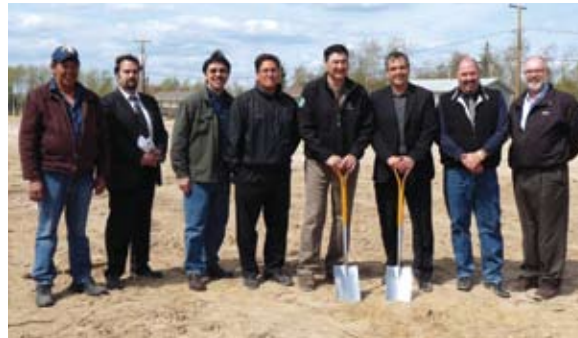
INAC officials, and their Provincial and First Nation partners, break ground for a new school for the Birch Narrows community, the first Departmental project under Canada's Economic Action Plan.

Implementing Canada's Economic Action Plan: Impact for Aboriginal People and Communities – An Update Fall 2009