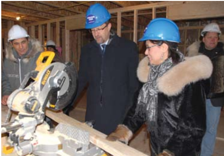
The Honourable Leona Aglukkaq, Minister of Health and Minister Responsible for the North and the Honourable Chuck Strahl, Minister of Indian Affairs and Northern Development and Federal Interlocutor for Métis and Non-Status Indians along with Minister Hunter Tootoo, Nunavut Minister Responsible for Housing tour a housing construction site in Iqaluit.