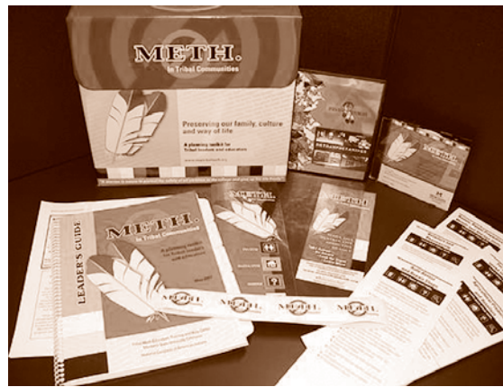
NCAI's No Meth Toolkit.

NCAI has been working on the issue of foster care for several years. The issue is the lack of direct access to federal funding for foster care and adoption services that states currently receive. In the last year, NCAI worked towards a federal funding stream for tribes to administer and operate foster care programs. NCAI helped to secure the support of leading members of Congress as co-sponsors for the Tribal Foster Care and Adoption Act of 2007.