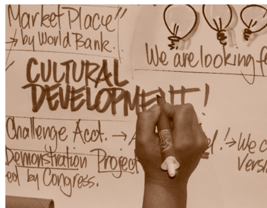
Participants brainstorm ideas at the National Native American Economic Policy Summit in Phoenix, Arizona.

Tribal and business leaders, academic scholars, influential government representatives and topic experts gathered in Phoenix in May 2007 for a unique and highly successful 3-day economic policy summit. The National Native American Economic Policy Summit (Summit), was hosted by NCAI along with the Office of Indian Energy and Economic Development within the Department of Interior.