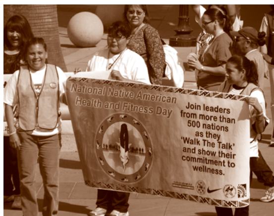
Participants walk during the NCAI's Annual Health and Fitness Walk at the 63rd Annual Convention in Sacramento, California.

With the support of the W.K. Kellogg Foundation, NCAI organized a meeting for our Board of Directors and the Boards of the National Indian Child Welfare Association, the National Indian Education Association, the National Indian Health Board, and the National Council of Urban Indian Health. The meeting, held in September 2007, provided a forum for the leadership of these organizations to strategize on avenues for addressing the needs of Native children through policies, legislation, and grassroots community action. The initiative's work will continue throughout the next year with each organization providing opportunities for their respective memberships to generate ideas for addressing the needs of Native children.