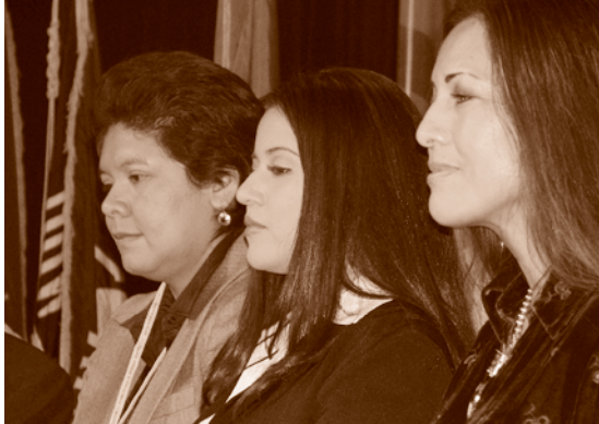
Former Miss National Congress of American Indians are honored at NCAI's 2006 Annual Convention in Sacramento, California.