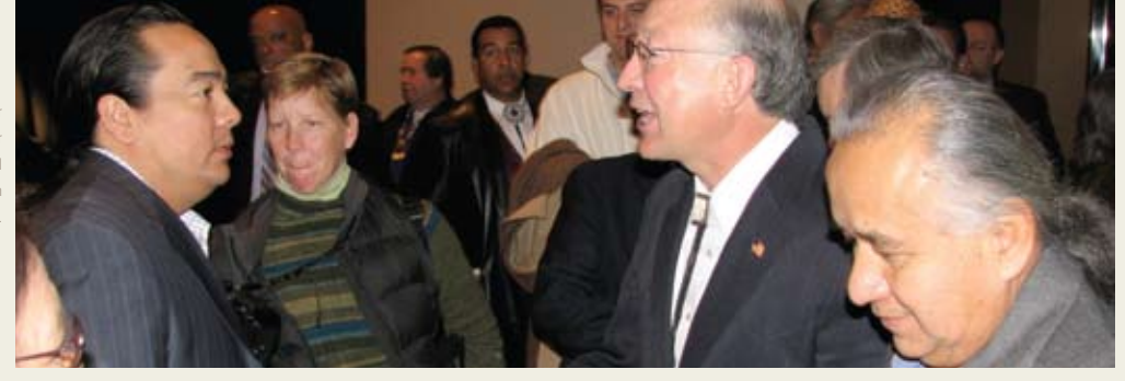
Department of Interior Secretary Ken Salazar shakes hands with tribal leaders at meeting in Crystal City.

The National Rural Assembly. The last several national elections have brought increasing attention to the role of "rural America" in influencing American policy. This influence has been evident in some features of recent federal policy, particularly with respect to the American Recovery and Reinvestment Act. While the definition of rural America has traditionally excluded America's most rural population (Native people and the tribal governments who serve them), the PRC has worked as a member of the Steering Committee of the National Rural Assembly to ensure the national discourse about rural America emphasizes the critical and unique role played by tribal governments. We expect Indian Country's role to be particularly significant as the Steering Committee plans to attend NCAI's Annual Conference in 2009 and plans a Youth National Rural Assembly.