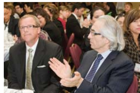
Saskatchewan Premier, the Honourable Brad Wall , and Phil Fontaine , National Chief, Assembly of First Nations