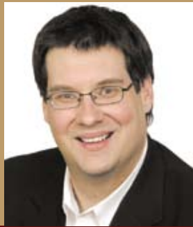
Honourable Kelly Lamrock