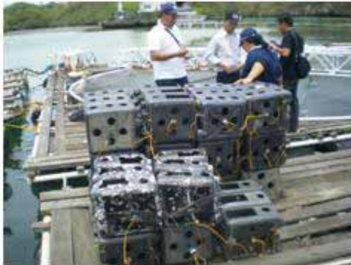
Fig. 8. Visit of the four Indonesian abalone specialists at the Igang Marine Station of SEAFDEC in Guimaras, Iloilo for the abalone grow-out culture facilities. Improvised cages made of local materials are used to culture H. asinina to marketable-size.