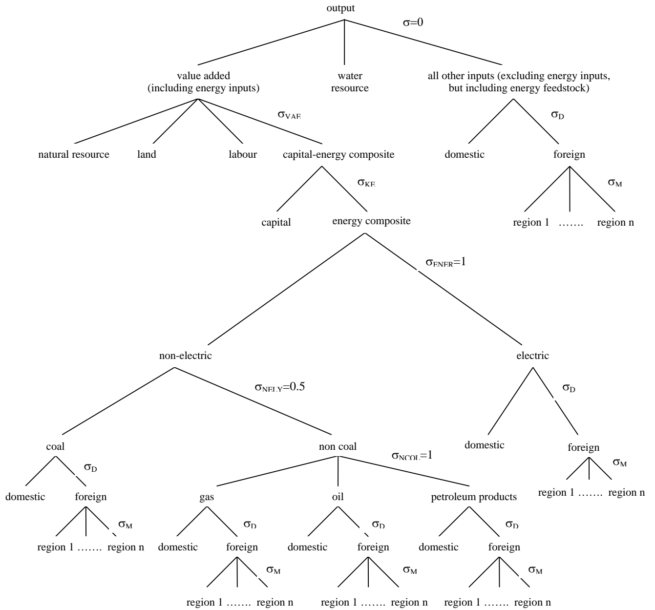
Figure A1 – Nested tree structure for industrial production process