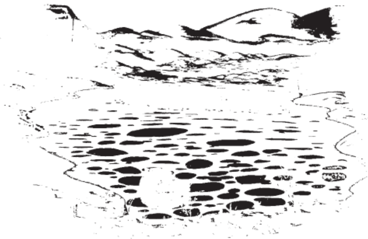
Spotted Lake - a well-known Indian sacred spiritual lake located in the Okanagan area.