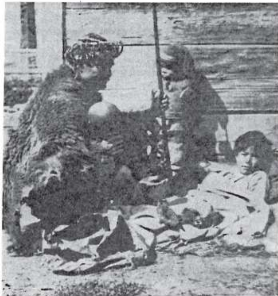
An Indian Doctor curing a young boy.