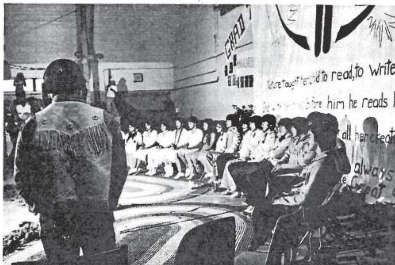
Mt. Currie Indian graduation ceremonies of their all-Indian controlled school.