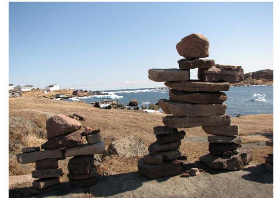
Red Bay, Labrador

The Department continues to work with staff and board members of the regional economic development boards in Labrador. Senior Analysts within Labrador Affairs work with respective Labrador Boards to promote communication on regional economic development issues. The Labrador Boards include Hyron Regional Economic Development Corporation, Central Labrador Economic Development Board, Southeastern Aurora Development Corporation and Labrador Straits Development Corporation.