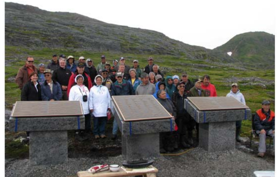
Hebron Memorial Ceremony, Hebron

Note to Reader: It is important to note that due to the nature of tripartite negotiations that it may be difficult to establish and meet specific milestones. Further, land claims negotiations are confidential; accordingly, it is not possible to report in detail on specific aspects of those negotiations. Moreover, while there may be agreement amongst the Parties on particular aspects of an Agreement, none of this is final until agreement is reached on all aspects of the proposed Agreement.