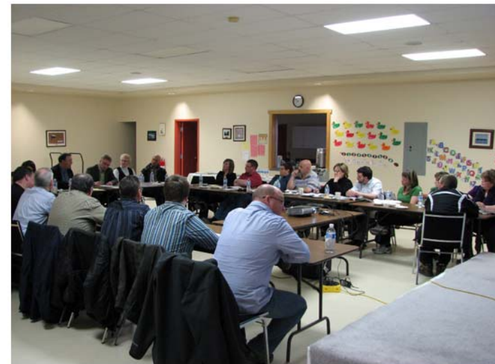
Northern Strategic Plan Session, L'Anse Au Loup

direction to enhance economic and social development in Labrador since all of the plan commitments support economic and social development.