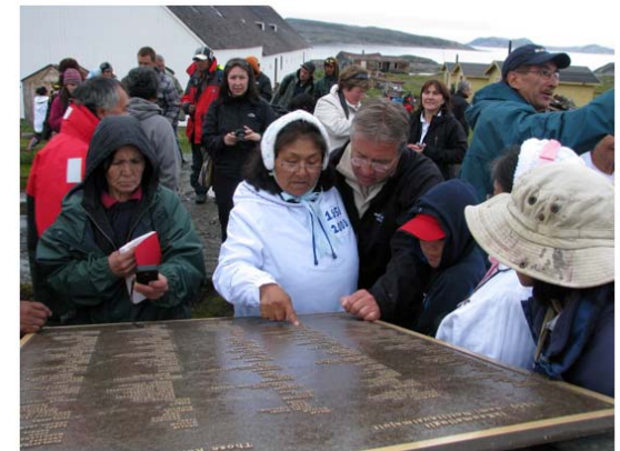
Premier Williams, Hebron Memorial Ceremony, Hebron

Against Drugs Campaign , where Canadian boxer George Chuvalo spoke to students in Conne River and the Labrador communities of Hopedale and North West River to share his personal experience of the tragic consequences of drug abuse.