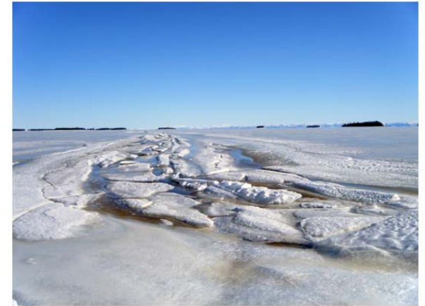
Ice flows near Northwest River, Labrador

In 2009 the Government of Newfoundland and Labrador introduced legislation in the House of Assembly that will assist in the resolution of land claims in northern Labrador and offshore areas adjacent to northern Labrador and northern Quebec. These amendments provide increased clarity and certainty for the future economic development of the region. The legislation was passed by the House of Assembly and received Royal Assent in December 2009. Once overlapping agreements are resolved by Aboriginal groups, they are able to come into effect when incorporated into the land claims agreements of each Aboriginal group. The Overlap Agreement between Labrador Inuit and Nunavik Inuit was incorporated into the Nunavik Inuit Land Claims Agreement in 2008.