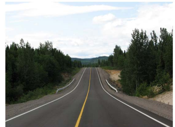
Trans Labrador Highway, Phase I

departments/agencies are informed through formalized reports.