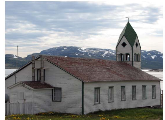
Moravian Church, Nain

provincial programs and services that benefit them. Aboriginal people in the province are eligible for all provincial programs and services of general application. Thus the benefits of the PRS initiatives also benefit Aboriginal people. Examples of initiatives that have been particularly beneficial to Aboriginal people have been identified in the Poverty Reduction Strategy's mid-term report.