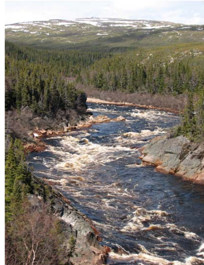
Pinware River, Labrador

people of the province, including the provision of applicable federal programs and services to the members of NunatuKavut.