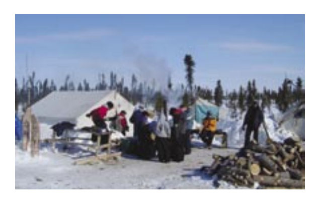
Students participating in a winter camp, Old Crow.

The vision also includes a Yukon First Nations school with pre-school, elementary and secondary school programs.