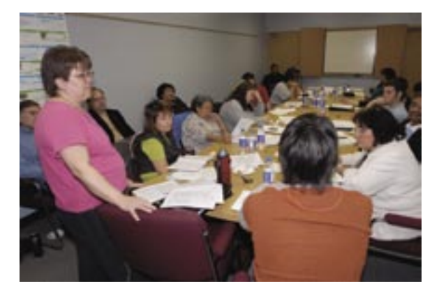
Members of YFNEAC at a 2006 meeting.