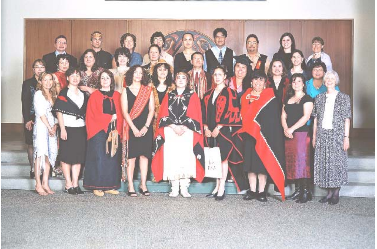
First Nations Graduates of November 2002 and May 2003