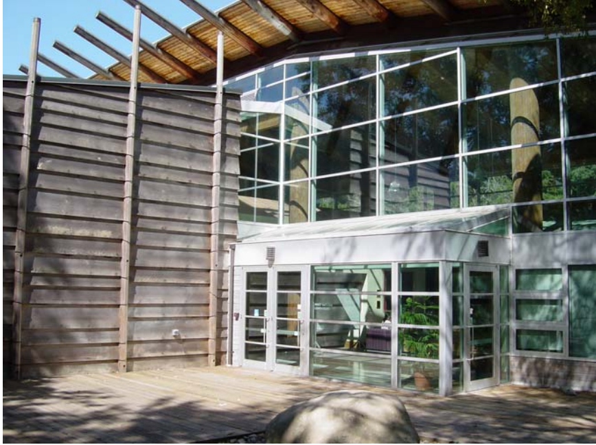
"Our Home away from Home"