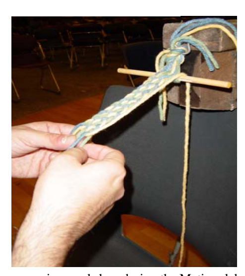
Finger weaving workshop during the Metis celebration, November 18, 2003.