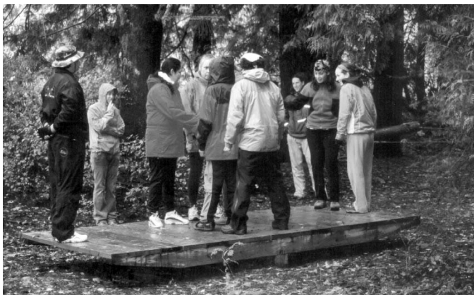
Rope Exercise – Longhouse Leadership Program