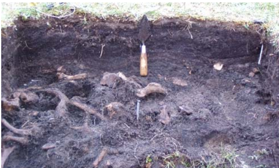
FIGURE 11: Wall profile of the test pit, view toward north.

We also excavated during weekends a test pit near Taylor's trench number 6. The excavation yielded a large quantity of bone and also many lithic artifacts showing the good remaining potential in the north area of the site however the stratigraphy is more difficult to understand (Figure 11). Our work permitted us to identify two layers that are maybe representing a single layer. We had no time to go deeper to identify other levels but compared with Taylor's work this is to be expected (Figures 12 and 13).