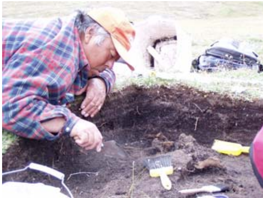
FIGURE 13: Mosusie helping us during weekend excavation