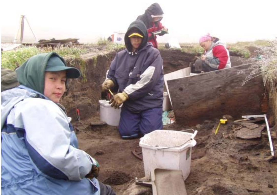
FIGURE 4: Excavation of level II

Until the beginning of August we worked to finish the excavation of what remained of the level II from the 2003 excavation (figure 4). As we were expecting we discovered in situ many new artifacts, bones and charcoal samples in a good state of preservation (Figure 5). Among others, we also discover a nice walrus carving (Figure 6). After that we were able to do a general cleanup of all zones excavated during previous years. This permitted us to have a general view of the structure and to take numerous pictures to complement the map of the structures (Figure 7, Figure 8 and Figure 9). With the rest of the pictures, a little more than a dozen pictures were taken to document the excavation directly classified in the computer each evening.