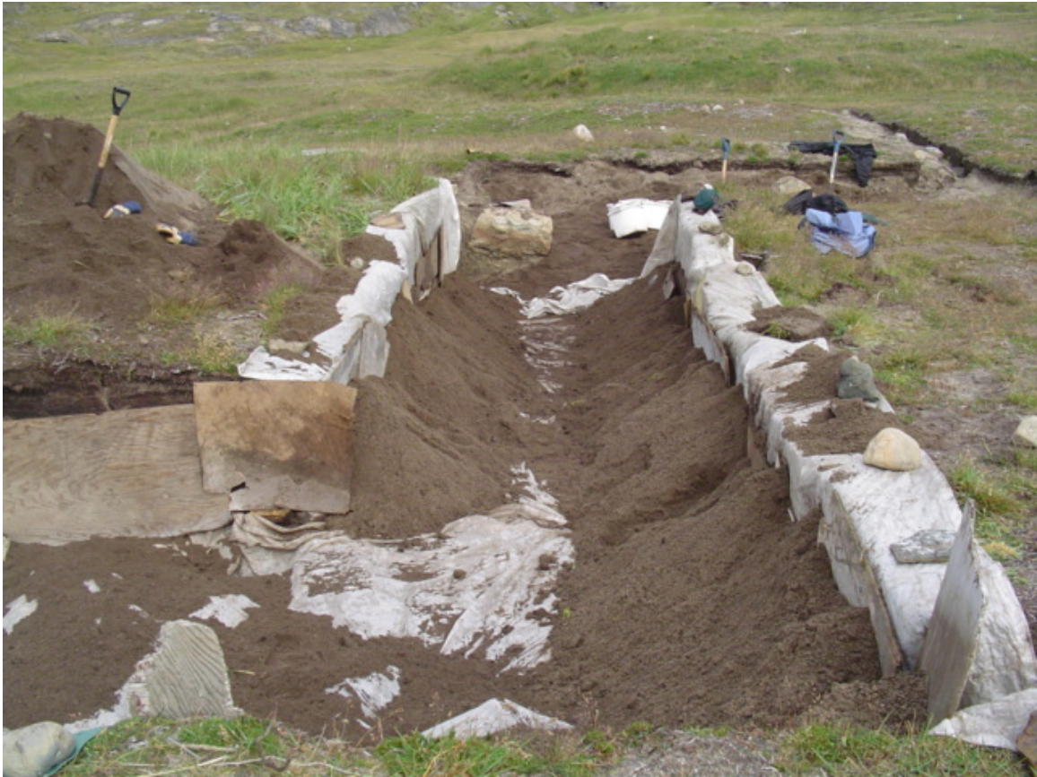
FIGURE 14: Closing the site, view toward north

The site was closed with plastic tarps covered almost completely by sand, filling the hole of the excavation (Figure 14). Finally we left the site around the 10 th of August without having time to visit the Toonoo site as it was initially planned when we applied for the archaeological permit.