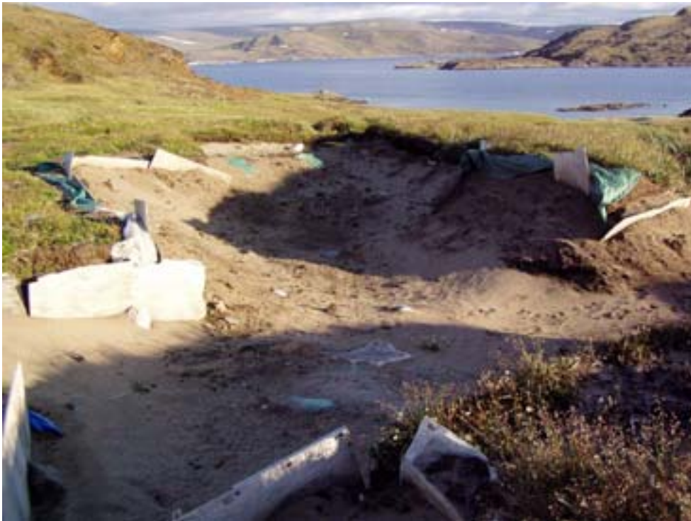
FIGURE 3: Site as it was when we arrived in mid-July 2005, view toward southwest

The site was excavated during a short period because we had a limited budget. We left Montreal on July 14 th and for different reasons (fog, strong wind...) we were not able to go on the island until July 17 th and finally rain prevented us from working with the excavation team on the Tayara site (KbFk-7) until July 19 th . The site had been covered with plastic tarps and the holes were filled at the end of the fieldwork season in 2003. Two years later everything had stayed in good condition, especially the wall profile protected with plywood (Figure 3).