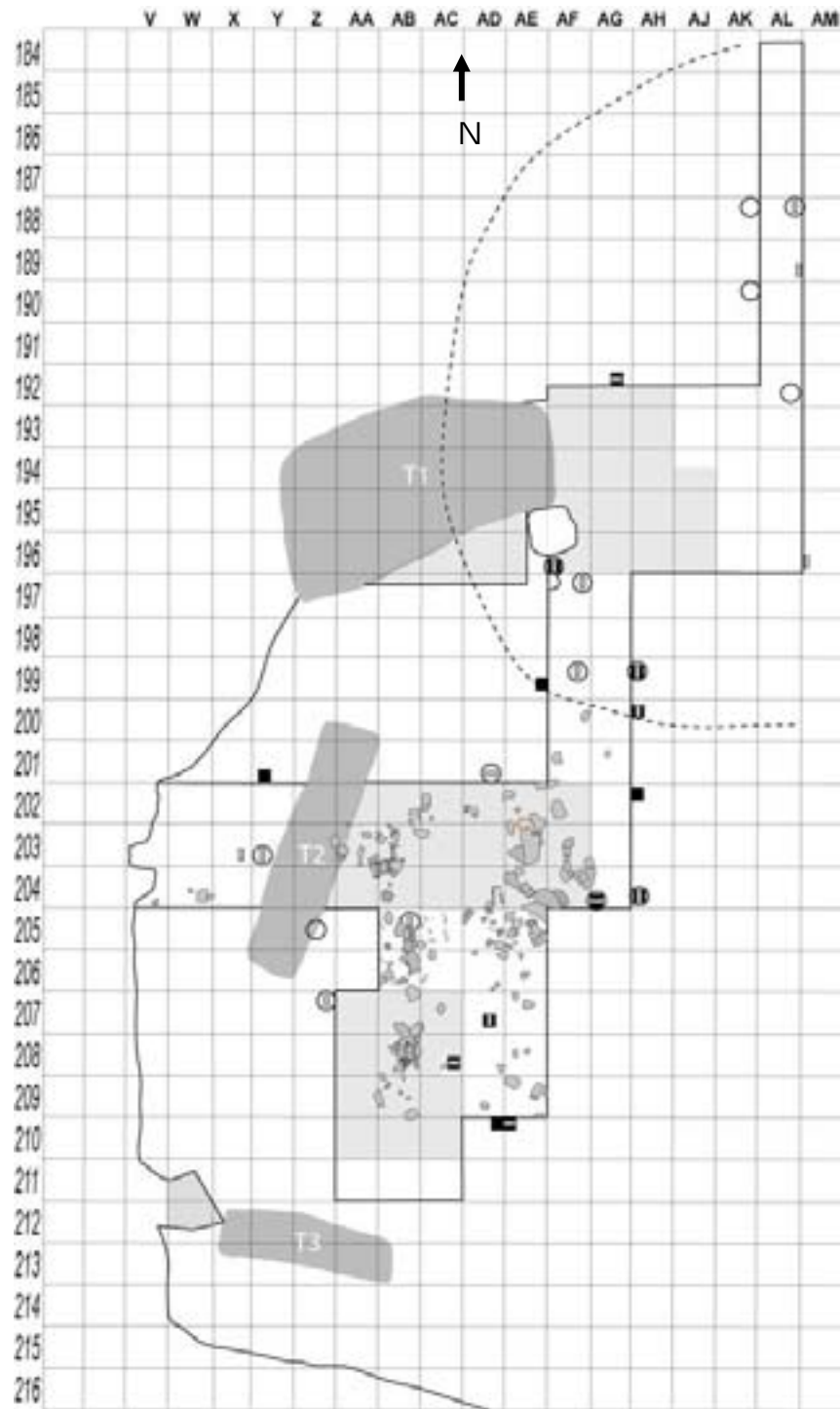
FIGURE 9: Site map, Taylor's trenches (dark grey and numbered T1, T2, T3), 2002 excavation (pale grey), 2003 and 2005 excavation of level II (white) except for squares AL-AK 196-184 representing zones with no archaeological layer, symbols refer to soil samples collected for geomorphological analysis (Scale: 1 metre the square side)