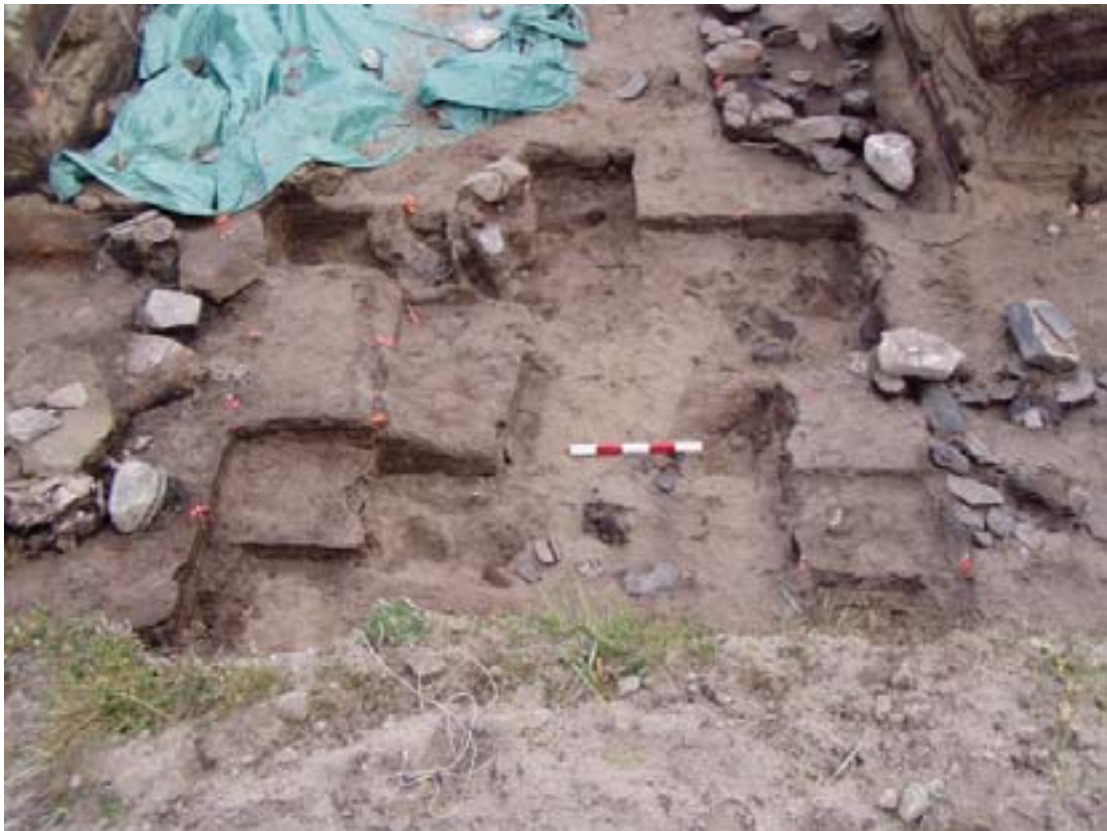
FFIGURE 10: Excavated part of level III, view toward south.

We started the excavation of level III with the main objective of finding characteristic material to document this occupation. We excavated around 6 square meters (Figure 10). We found bones and sparse lithic artifacts but nothing really characteristic. No clear evidence of structure was found but a few small stones may indicate their presence. Bone is in a different state of preservation than in level II: it is more fossilized. A good demarcation exists between the two layers and we were pleased to find they apparently have not been mixed even if they are sometimes separated by a sterile layer less than 10 cm thick.