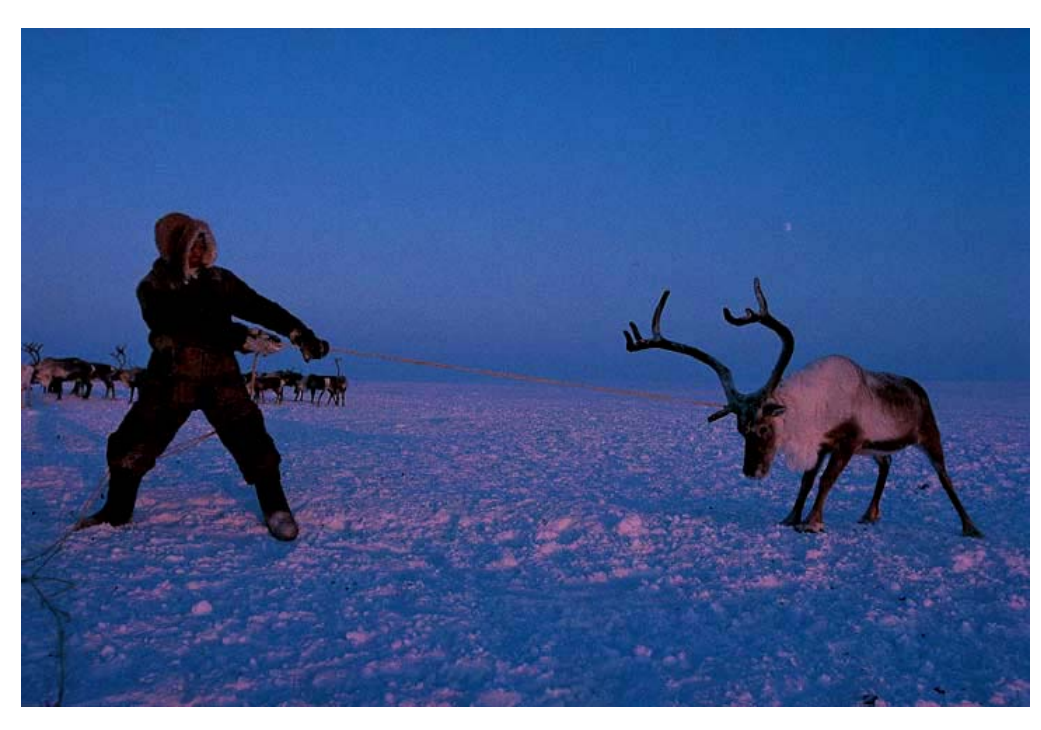
Reindeer herding in the winter tundra, Yakutia.

30301978200000000081 Kamchatka Branch, 18 Leninskay Street, Petropavlovsk-Kamchatsky, Russia.