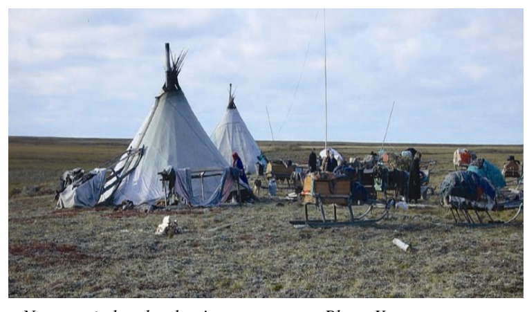
Nenets reindeer herders' summer camp.

The following is a very rough summary. A detailed project description can be obtained from the authors.