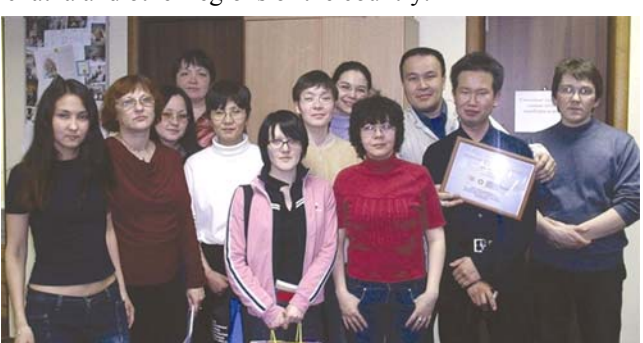
Representatives of indigenous information centres met in Moscow, April 2005

Information given by the information centers on the Internet and in printed publications reflects not only the legislation concerning indigenous peoples' issues in Russia and the indigenous peoples' movement, but it also supports the protection of the areas which indigenous peoples inhabit from the activities of oil and gas companies and other intensive resource exploiters. At the beginning of the 2000s, a wide information campaign through the indigenous peoples' mass-media illuminated the conflict between the Primorsk Association of Indigenous People with the transnational corporation "Khendey" and the company "Primorsklesprom"<sup>5</sup>. This resulted in the support of the case by legal defense and nature protection organisations. Similar cases in which information campaigns supported indigenous peoples in conflicts occurred in Sakhalin, Kamchatka and other regions of the country.