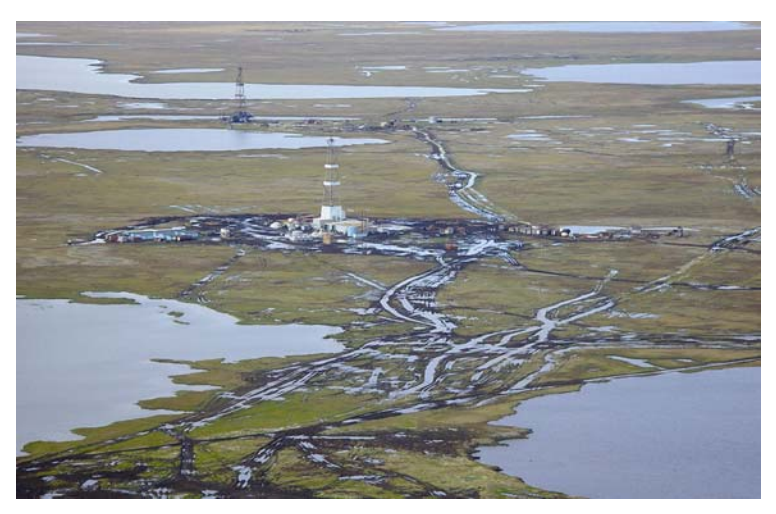
Tundra damaged by oil drilling.