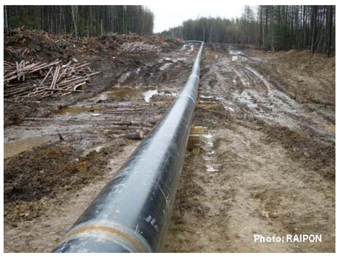
Oil pipeline construction site in Sakhalin

consultations with the representatives of these indigenous groups. There are no results from the poll on the special features of the traditional land use of these groups. There are a few other requirements of Operations Policy 4.10 "Indigenous Peoples" which have not been satisfied. RAI-PON's conclusion also contained the remark that the beginning of the direct dialog between Sakhalin Energy and the indigenous peoples and their collaboration on the Development Assistance Plan are in fact progressive and RAI-PON is ready to assist it as much as possible. But the developers of the plan seemed to have only perceived the negative part of RAIPON's statement and felt offended. At least, before the workshop began, the plan developers had been apprehensive regarding any intervention by RAIPON. It is important to mention that the Regional Council of