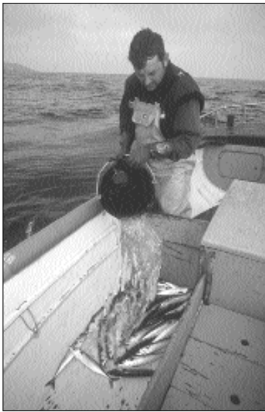
MSC-certified mackerel, caught using handlines, Cornwall, UK

by governments to ensure that these comply with the Code. li As with the mandatory technical regulations, the Code expresses a preference for international standards.