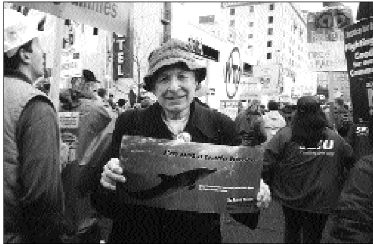
Protester against WTO, Seattle, Washington, USA, 1999